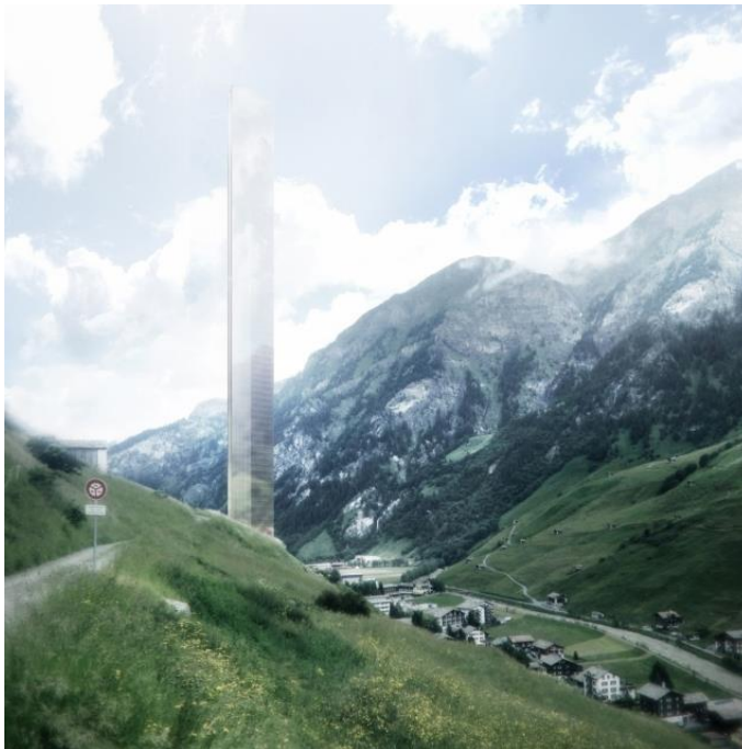
Fig. 11. Visualisation of tower 7132 in Vals, designed by Morphosis, 2015–2017. Source: [99]

A rather unusual location is planned for the slender skyscraper 7132 (Fig. 11), designed by Morphosis: the mountain village of Vals in eastern Switzerland (the Canton of the Grisons). The village of Vals, stretching along a valley, is small, with about a thousand inhabitants, and is mainly known for its hot springs.