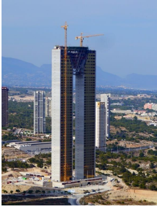
Fig. 10. Intempo skyscraper, Benidorm, photo by © Tomi Eronen/KONE, CTBUH. Source: [79]

The Intempo tower has a somewhat pretentious shape – it consists of two towers connected at the highest parts by an elliptical cone pointing downward – but it is very slender. Its height is 180 m and the width of the narrower side is 16.7 m, resulting in a width-to-height ratio of 1:10.8 [98]. The slenderness ratio of the Intempo tower is comparable to the very slender skyscrapers of New York, but it represents a different type of tall, slender building. The joining of two towers at their highest part into one structure creates the impression of striving for a building with a characteristic shape rather than one that impresses with its slender proportions. When viewed from the wider side, the building may resemble the letter “M”.