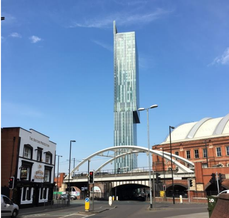
Fig. 8. Manchester. Beetham Tower as seen from the narrow side.

Completed in 2006 in Manchester, the elegant fifty-story Beetham Tower (height: 157 m) has a slenderness ratio of the narrower side of 1:10. According to information from the portal Skyscrapernews.com, this ratio placed it in the group of the slimmest skyscrapers in the world in the first decade of the 21st century [78]. The building's height is increased to 169 m by the extension of one of the wider façades – the “glass ‘blade’” [75], [79]. Additionally, the tower widens slightly from the twenty-fourth floor upwards, enhancing the effect of a vertical slim plate and giving the building a striking expression. The difference in width reflects the building's dual functions: the lower part houses hotel rooms, while the upper part contains residential apartments. It is noteworthy that construction of the skyscraper began in 2004, and the procedure preceding it, related to obtaining construction consent, started in 2003 [76].