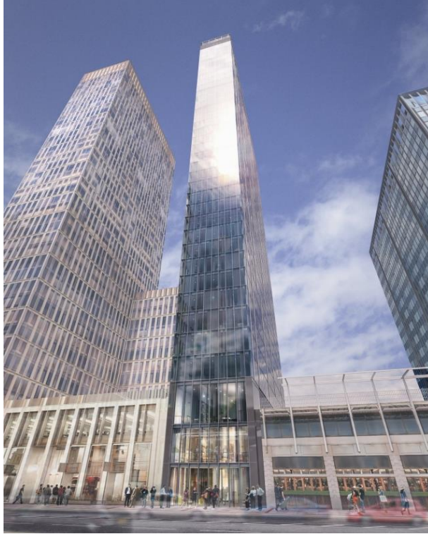
Fig. 9. Visualisation of 211 Broad Street skyscraper in Birmingham.

and architectural perspective. According to Lisa Deering of Glancy Nicholls Architects, “advances in engineering and construction technology have allowed us to design an iconic building that will enhance Birmingham’s skyline and bring a new type of skyscraper to the city” (L. Deering, 2020, after: [85]).