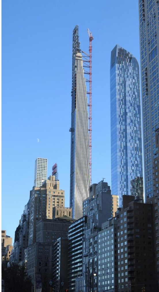
Fig. 2. 111 West 57th Street, New York, photo by Jim.henderson (CC BY-SA 4.0). Source: [47]

The 57th Street, which hosts the aforementioned Steinway Tower and its surroundings, is now home to some of Manhattan's tallest slender skyscrapers. The same urban block houses the soaring One 57 high-rise building. Nearby, the tallest of New York's super-slender buildings has been recently built - the Central Park Tower (height: 472.4 m), with a slenderness ratio of 1:23. In the adjacent block, on 58th Street, stands 220 Central Park South (height: 289.6 m). The eastern part of 57th Street is where we find the urban block containing the 432 Park Avenue skyscraper described earlier.