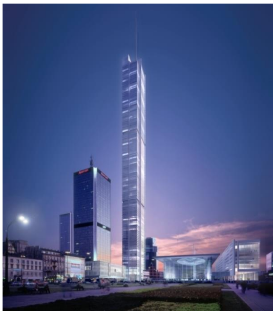
Fig 5. Lilium Tower, Warsaw, designed by Richard Meier & Partners Architects, 2007, rendering by Studio Horák.

In 2007, a competition to design a skyscraper in the center of Warsaw named Lilium Tower saw American architect Richard Meier propose a building about 400 m high (Fig. 5) [64]. 1 The skyscraper would have a shape similar to a narrow cuboid, with its height several times greater than its width. Wojciech Oleński [67] was fully justified in describing this building as a “super-slim skyscraper”. The shape, proportions, and height of the building designed by Richard Meier are unmistakably reminiscent of the very slender American skyscrapers rising in Manhattan. In a sense, certain similarities can be observed in their location – in both cases, these are skyscrapers at the heart of the city, although we are talking about completely different cities on different scales.