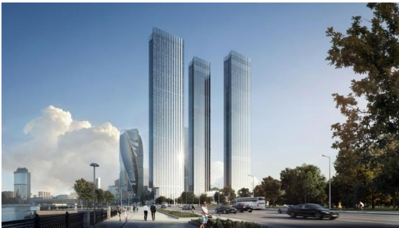
Fig. 4. Visualisation of the Multifunctional High-rise Residential Complex on Krasnopresnenskaya Embankment, designed by Sergey Skuratov Architects, 2016–2020.

In Moscow City, three slender Capital Towers (Multifunctional High-rise Residential Complex on Krasnopresnenskaya Embankment, designed by Sergey Skuratov Architects) (Fig. 4) are nearing the end of construction. They were designed for the eastern part of Moscow City, away from the existing high-rise buildings, next to a park. The towers are arranged parallel to each other but offset from one another and connected by a low, wide podium. Each tower is 266 m tall, and the length of the narrower side is about 22 m [63], resulting in a slenderness ratio of over 1:12 (visually, Tower “B” appears the slimmest as its longer side is the shortest among the three buildings). The complex was designed on a plot of over 3 ha. The facilities cover an area of 8,085.35 m 2 , with a large part of the remaining space allocated for a park and a recreation and rest area [63].