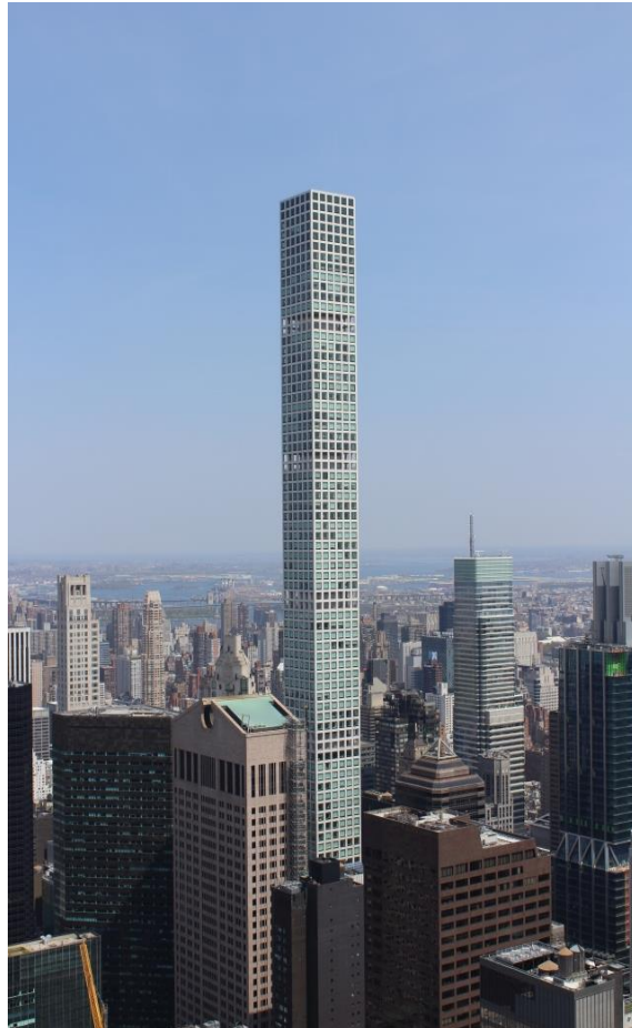
Fig. 1. 432 Park Avenue, New York, photo by Percival Kestretail (CC BY-SA 3.0). Source: [47]

The second tallest slender skyscraper in New York City is 111 West 57th Street, also known as Steinway Tower, standing at 435.3 m high (Fig. 2). The ratio of the podium's side to the building's height is 1:24.3, making it the most slender in the world. Completed in 2021, the skyscraper was built in one of Manhattan's rectangular urban blocks between West 57th Street and West 58th Street. This modern construction rises from the interior of the historic Steinway Hall building, dating back to 1925 (the former headquarters, showroom, and offices of the renowned Steinway & Sons company, which manufactures pianos). The skyscraper's construction was integrated with the renovation of this building [10], and together they form an architectural unity. The slender tower protrudes high above the buildings of the urban block that separates it from Central Park. It has a simple shape that becomes quite distinctive when viewed from the side – beyond a certain height, it tapers upwards on one side with small setbacks, forming a gentle arc. This building is one of the most spectacular super-slender towers in New York City.