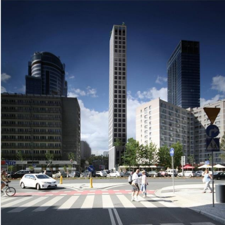
Fig. 7. Visualisation of the skyscraper at Mariańska and Twarda streets in Warsaw, designed by CUBE. Source: CUBE Architects, after: [72]

slenderness ratio of the building would be approximately 1:12. The architectural form of this slender tower is quite simple. The design of the façade creates a regular, very expressive rhythm of square windows, to which the form of the multi-story podium and the top of the building are subordinated. In one article, the skyscraper was described as reminiscent – due to its slender character – of the New York skyscraper at West 57th Street [72].