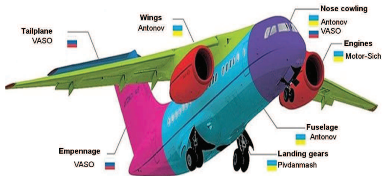
Fig. 2. Cooperation of aircrafts An-148