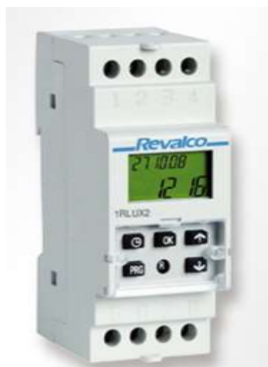
Fig. 2.11 Astronomical switch

Astronomical switch (Fig. 2.11): this device has a special program that follows the timetable of the sunrise and the sunset of a specific geographic area just by putting the latitude and the longitude. Depending on the model, reprogramming can be done on a weekly basis up to 10 years after. They also have the possibility of advance or delay the timetables uniformly. This type of switches must have a good time base and a proper adjustment of the precision, if not, the system could be losing effectiveness over time [9].