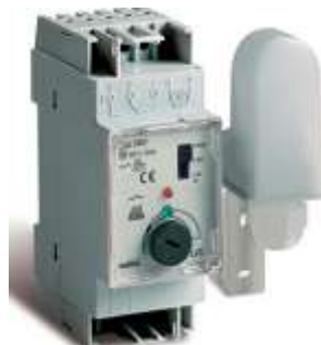
Fig. 2.10 Twilight switch

Twilight switch (Fig. 2.10): is an electronic device that has a photovoltaic cell. This cell compares the environmental luminosity with a preset value and based on this comparison, it turns on or off the lighting [9].