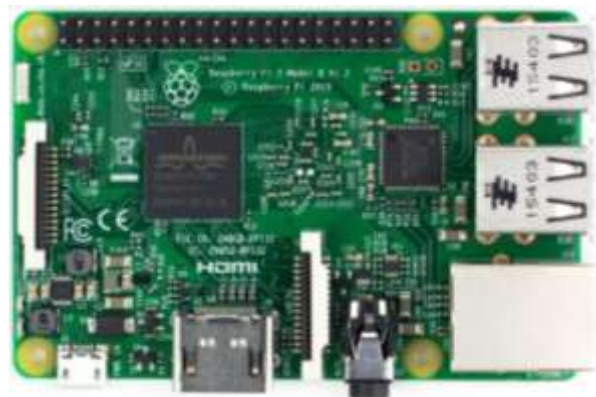
Fig. 2.7 Raspberry PI

On this computer the operating system that you want only to be loaded is necessary to load it onto the SD card and insert it into the reader. For this project any operating system compatible with Microsoft Excel, can load the worksheet is in this format. This computer will be in charge of calculating hours power-lighting for a given date and latitude and length.