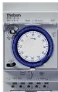
Fig. 2.9 Analog switch

Analog switch (Fig. 2.9): is an electromechanical device that turns on and off the lighting at a preset time. It is a very simple system but not so efficient because, as time goes by, some disarrangements happens. This means that some delays or advances will occur over the time that lights should to turn on or off [9].