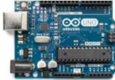
Fig. 2.8 Arduino UNO

Therefore, this automaton is responsible for performing the power-the lighting.