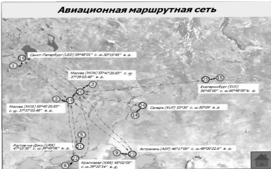
Fig. 2. Central part of TTN. Gateway Distribution centers to airline network and aircraft fleet