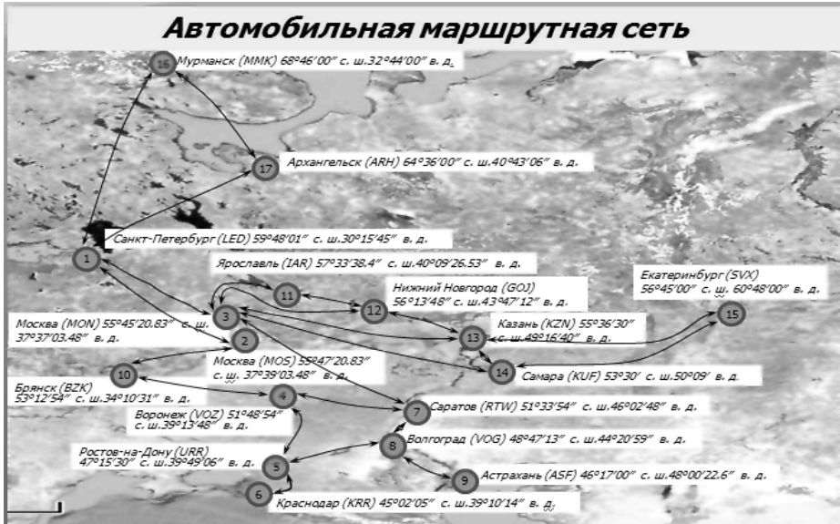
Fig. 1. The central part of TTN. Head DC and car route network

In total, transport terminals network basic version contains n = 31 head DC, nav = 21 terminals of approach to aviation network and nRS = 11 terminals of approach to the rail network.