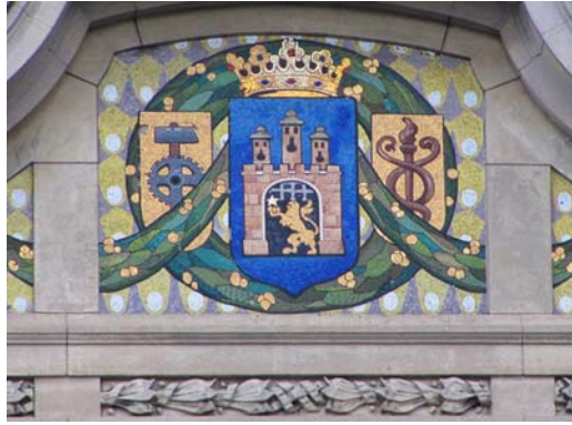
Fig. 3. Fragment of mosaic from the facade of the Prosecutor's Office of Lviv Region (the former Chamber of Commerce and Industry at 17/19 T. Shevchenko Avenue).