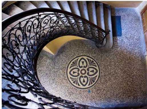
Fig. 5. Fragment of interior decoration of the residential house staircase, 5 I. Hryhorovych Str.; Source: il. N. Piddubna, 2017