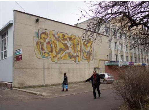
Fig. 4. Fragment of facade of the Sports Palace "Halychyna", SOLIT Ltd. (the former „Budivelnik”), at 8 Kerchenska Str.