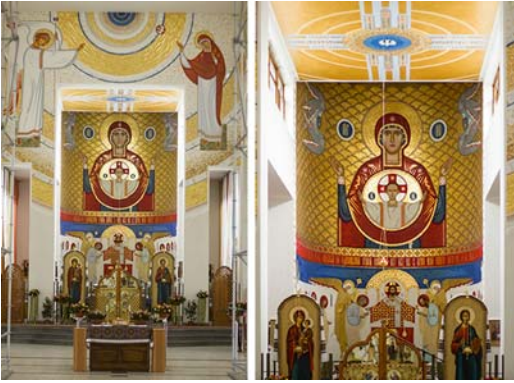
Fig. 2. Fragments of interior decoration of the Church of the Nativity of the Blessed Virgin Mary at 2 Pope John Paul II Square. Source: il. N. Piddubna, 2013