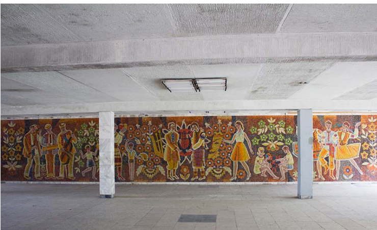
Fig. 6. Mosaic composition in the interior of the Palace of Culture LORTA at 2 Riashivska Str..