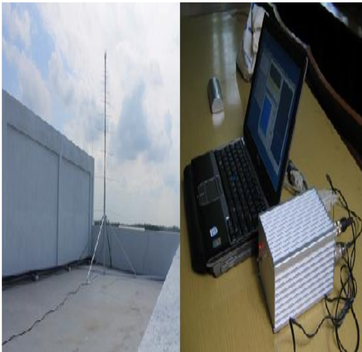
Figure 3. Installation of the LPDA and the CALLISTO system.