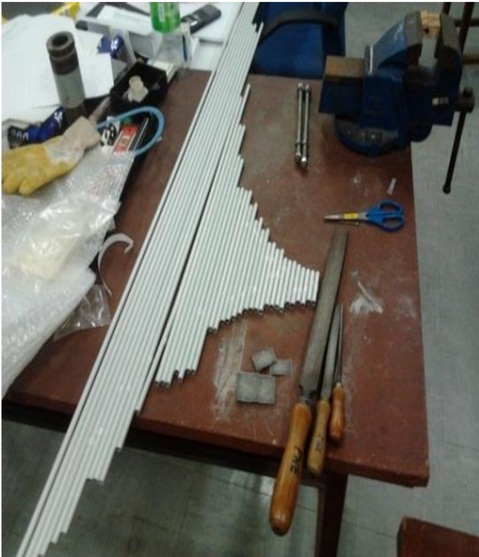
Figure 1. The elements of the antenna at different sizes.