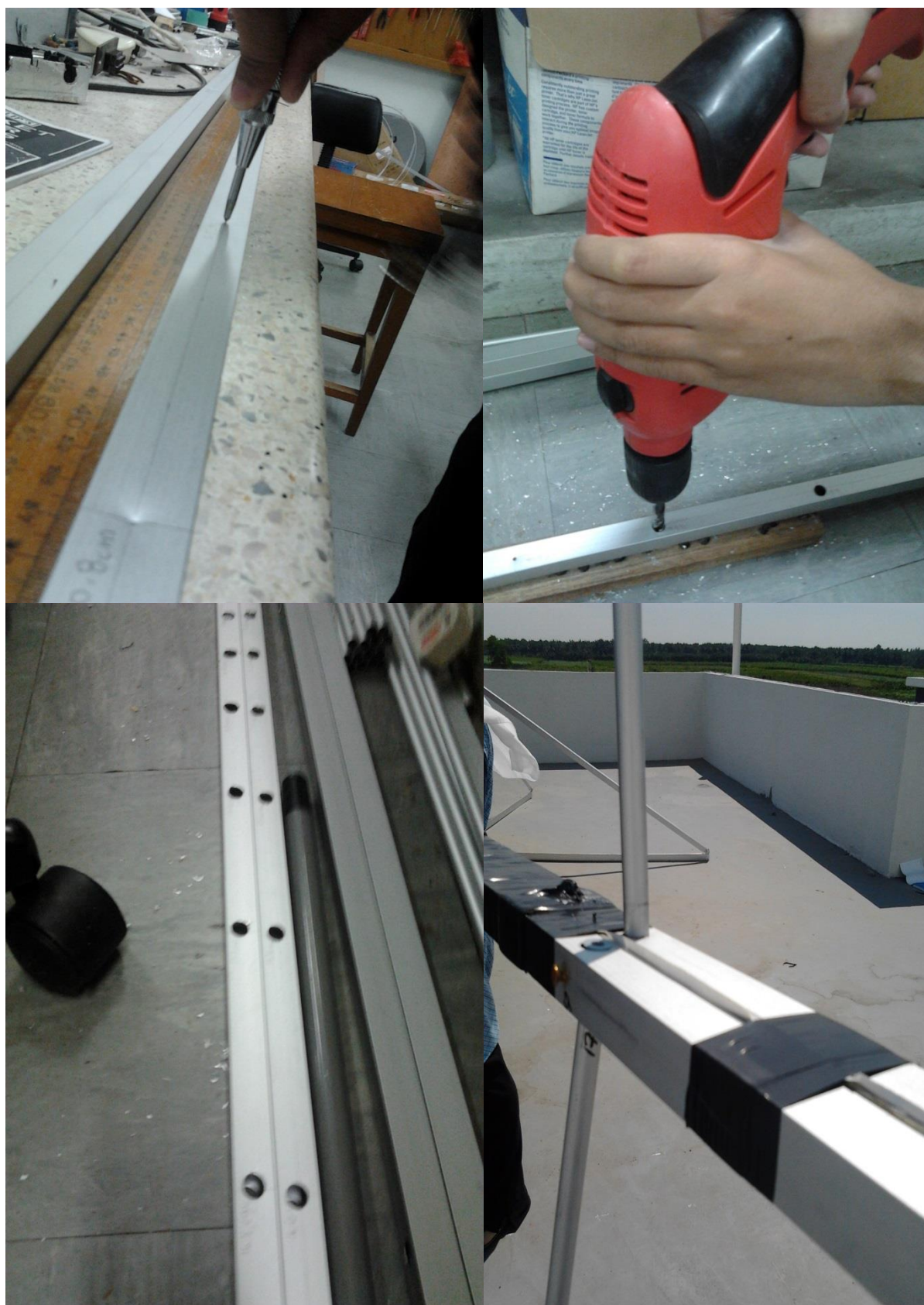
Figure 2. Preparation of construction of LPDA.