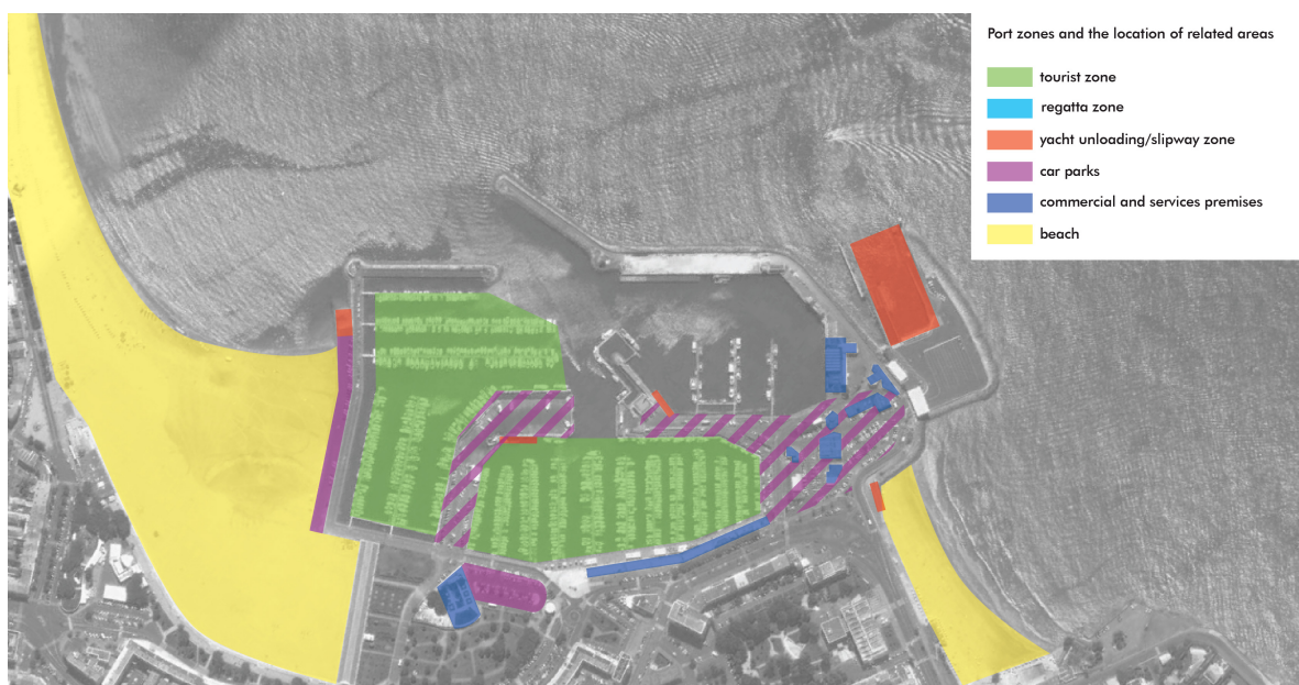
Fig. 3. Port layout in relation to transport

Most of the port area is earmarked for handling of tourist ships; in addition, a part of the quay is adapted to handle smaller transport ships (Fig. 3). The marina has quite large unloading infrastructure, which increases the rank of facility for handling the tourist and transport part; besides, in the eastern part, beyond the breakwater, there is an additional slipway for handling small pleasure craft [5].