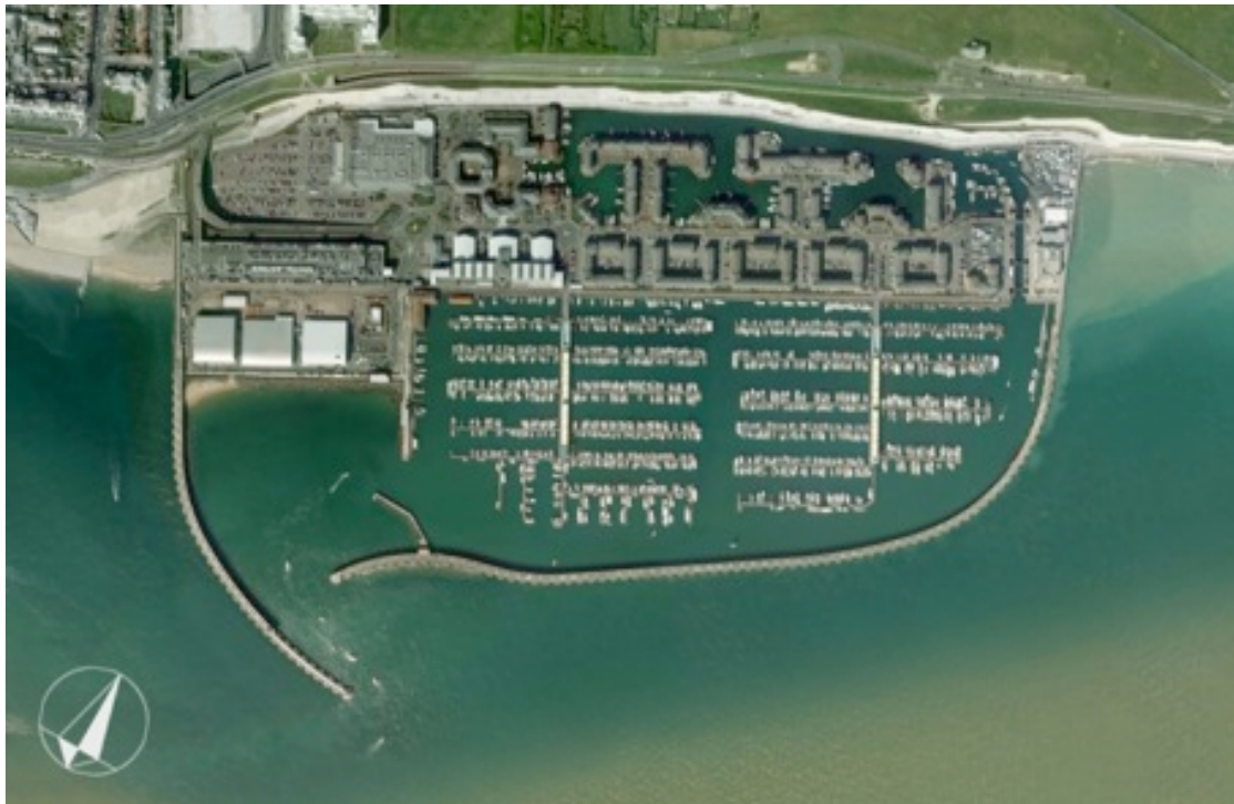
Fig. 4. Satellite photo of the Brighton Marina [6]

The marina in Brighton distinguishes itself from many other marinas not only in the UK, but also in Europe (Fig. 4). As one of few schemes, it provides such comprehensive, and yet complex and functional solutions for its users [2].