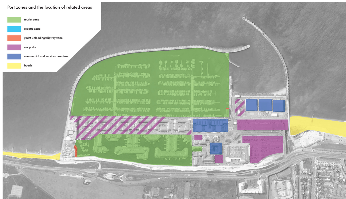
Fig. 6. Port zones and location of related areas on the basis of satellite photos