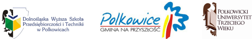
Picture 1. Logotypes: Lower Silesian University of Entrepreneurship and Technology in Polkowice, Polkowice and the Polkowice University of the Third Generation.