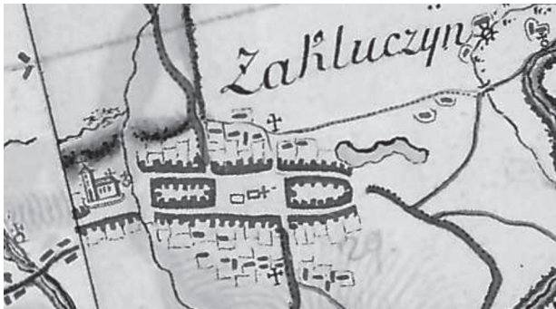
Fig. 1. Zakliczyn on the First Military Survey – the Map of Galicia and Lodomeria in the years 1769–1783

Il. 1. Zakliczyn na I Zdjęciu Wojskowym, Mapie Galicji i Lodomerii z lat 1769–1783 (źródło: Archiwum Katedry Historii Architektury i Konserwacji Zabytków, WA PK – Zespół Historii Urbanistyki, fot. mapy)