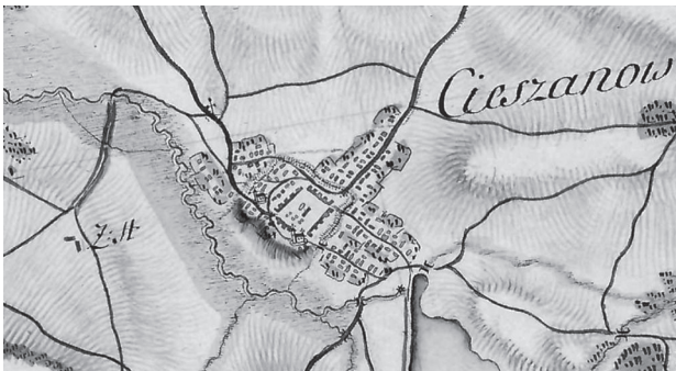
Fig. 4. Cieszanów on the First Military Survey – Map of Galicia and Lodomeria of 1769–1783

An analysis of Cieszanów's historical plans, namely that of the First Military Survey – Map of Galicia and Lodomeria of 1769–1783, the Galician Cadaster of 1848, the Second Military Survey – Map of Galicia and Bukovina from 1861–1864, when confronted with an up-to-date survey map and an orthophotomap (Fig. 6) allows us to state that, essentially, the Renaissance-period historical urban layout of Cieszanów has survived into the present. This observation concerns both the shape and size of the market square and the development blocks around it, especially the western, northern and southern ones. It should be noted that the fact that the town's historical develop-