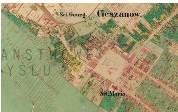
Fig. 5. Cieszanów on the Galician Cadaster from 1854

Il. 4. Cieszanów na I Zdjęciu Wojskowym, Mapie Galicji i Lodomerii z lat 1769–1783