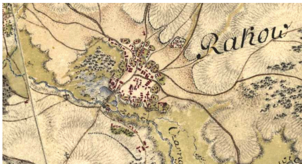
Fig. 7. Raków on the First Military Survey – Map of Eastern Galicia of 1801–1804