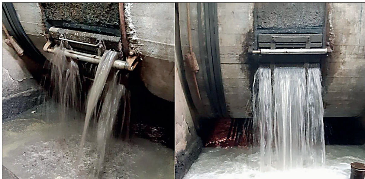
Figure 2. Bath discharge from a tannery drum in a small plant in the Podlaskie Province. From left: bath after liming process; water discharge from rinsing stage

weighing 1400 kg was determined, which is about 22 m 3 after tanning processes and about 4.8 m 3 after bath finishing processes. The total volume of wastewater for this batch is 26.8 m 3 . To this value, we should add the volume of wastewater used for domestic needs, wringing, washing machines, containers and floors, as the used water from these processes also goes to the wastewater tank. Assuming the total volume of produced wastewater to be 30 m 3 for a batch of 1400 kg of hides, the volume of wastewater per one ton of hides is 21.43 m 3 . Since the production capacity of the plant is variable, depending on the period, 3 or 4 full production cycles were carried out per month. Therefore, assuming that each cycle was identical, the plant generates between 90 and 120 m 3 of wastewater per month. Wastewater samples were collected in 2021 during processes of leather production. The following samples were collected from the constituting processes: 1) mixed drains from presoak and soak; 2) mixed effluent from the initial steeping, the actual steeping and the liming process; 3) drain from decalcification taken directly from the drum; 4) mixed effluent from the preliminary steeping, proper steeping, liming, decalcification and pickling processes; 5) mixed effluent from pickling and tanning processes. Samples were collected from the general wastewater tank, the chromium wastewater tank and directly from the bathing sink. Each time wastewater samples were filtered and each