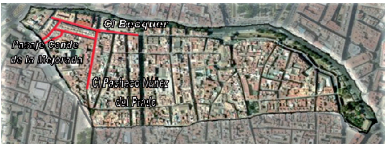
il. 6. Identification of areas for priority action (7)

The next step of this phase is to dump the information in the ArcGIS programme using ArcMap, the main component of the processing program.