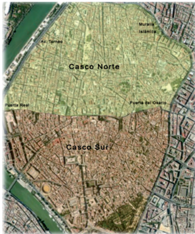
il. 3: Borders of the northern and southern areas of the city, constituting the historical centre of Seville (7)