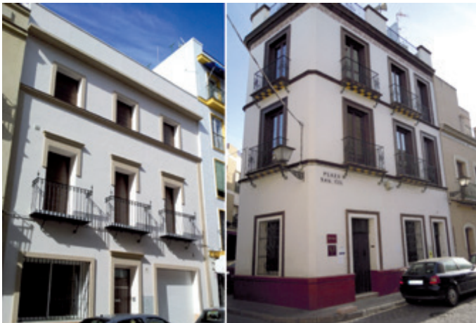
il. 7. Rehabilitated dwelling in Beker Street (left) and Plaza San Gil

The procedure carried out for the creation of the database is comprised of 4 steps: