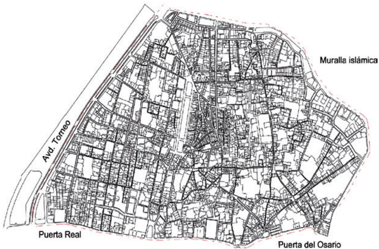
il. 4. Hypothetical axis delimiting the northern part of the historical centre of Seville