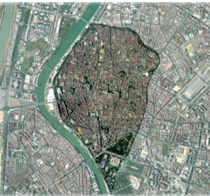
il. 2. Historical centre of Seville. Andalusia (7)