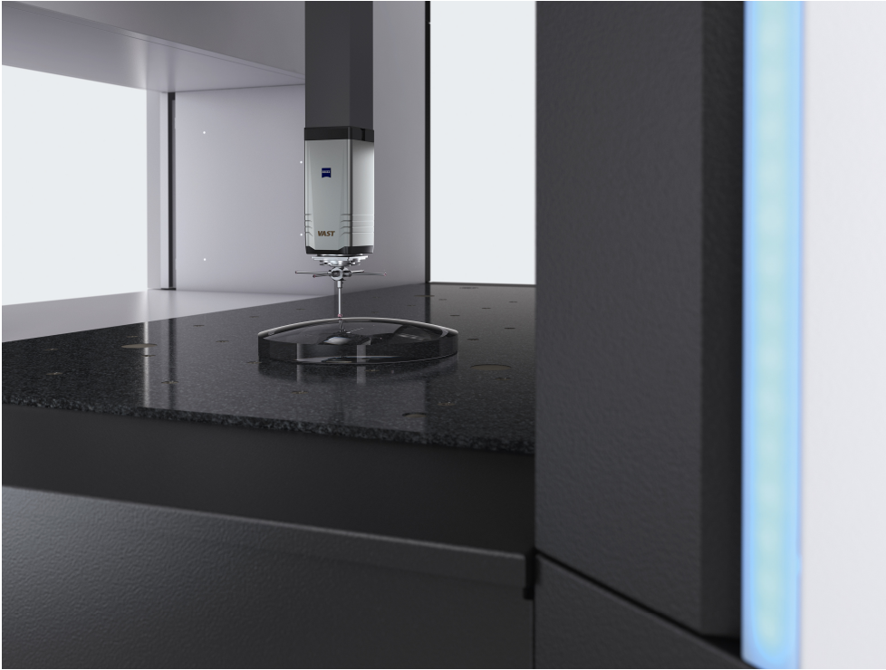
The new VAST gold probe from ZEISS was developed to meet maximum demands on sensitivity, accuracy and reproducibility