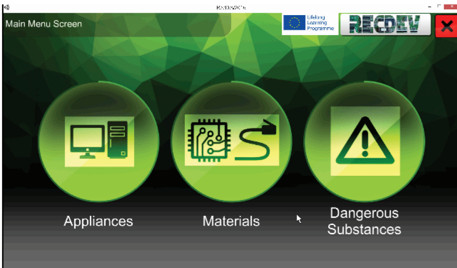
Figure 1. Main menu of 3D Tool