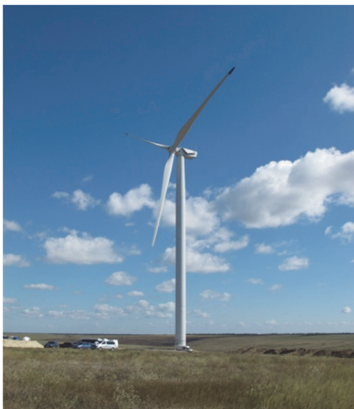
Figure 2. The wind park «Ochakov» in the Mykolaiv district of Ukraine

In the Mykolaiv district the wind park «Ochakov» (Figure 2) with 500 megawatts works and the Tiligulsky hydroelectric power station is planned to be built. This project is investment attractive. In the present conditions the payback of the solar stations makes up 5 years, and the wind ones – 7. In 2013 in the Mykolaiv district the first solar plant of 29.3 MW power was opened. The power plant consists of 121,176 polycrystalline solar modules installed in 4 rows, and 27 inverter stations. It is planned to establish the similar 6 environmentally friendly power plants in 6 regions of the territory.