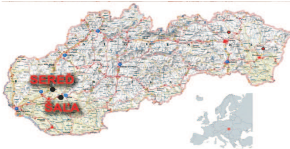
Fig. 1. Location of the towns of Sala and Sered in Slovakia

Sala and Sered are both located in the southwest part of Slovakia (fig. 1), in the warmest and most fertile area with the longest period of sunshine during the year. These localities belong to the central depression of the Danube basin from the geological point of view. The Vah River, the largest Slovak river, flows through both of the towns. In 2012, the population of Sala and Sered was 23,440 and 16,214 inhabitants respectively. Several district heating systems owned and operated by the municipalities were built in these towns. The annual heating period lasts approximately 210 days.