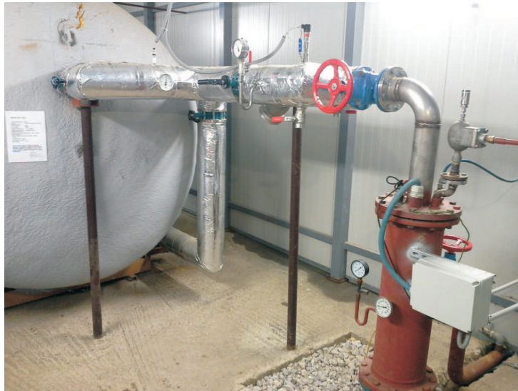
Fig. 3. Well head of SEG-1 geothermal well and accumulation/degassing tank in Sereď