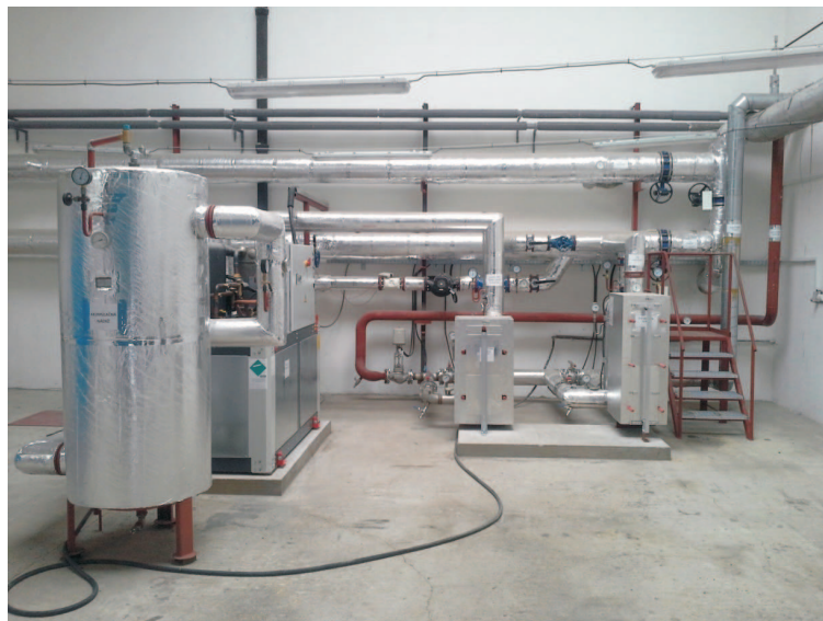
Fig. 4. Geothermal heat exchanger station in K5 boiler plant in Sereď