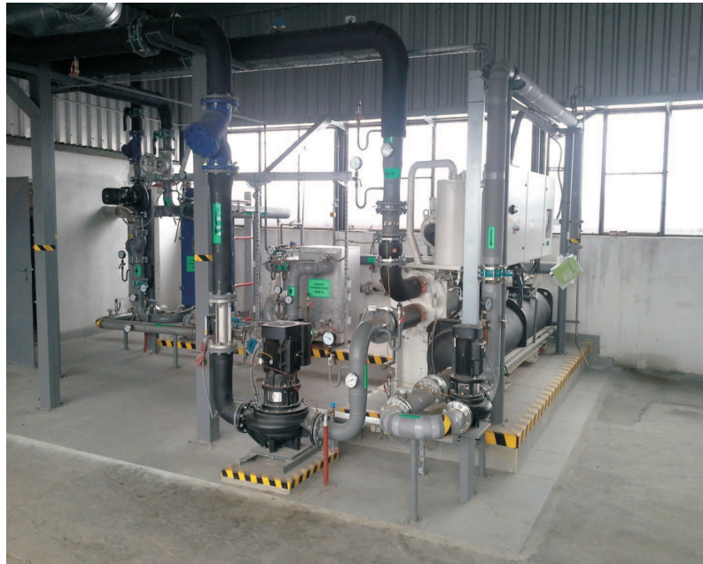
Fig. 2. Geothermal heat exchanger station in CK31 boiler plant in Sala