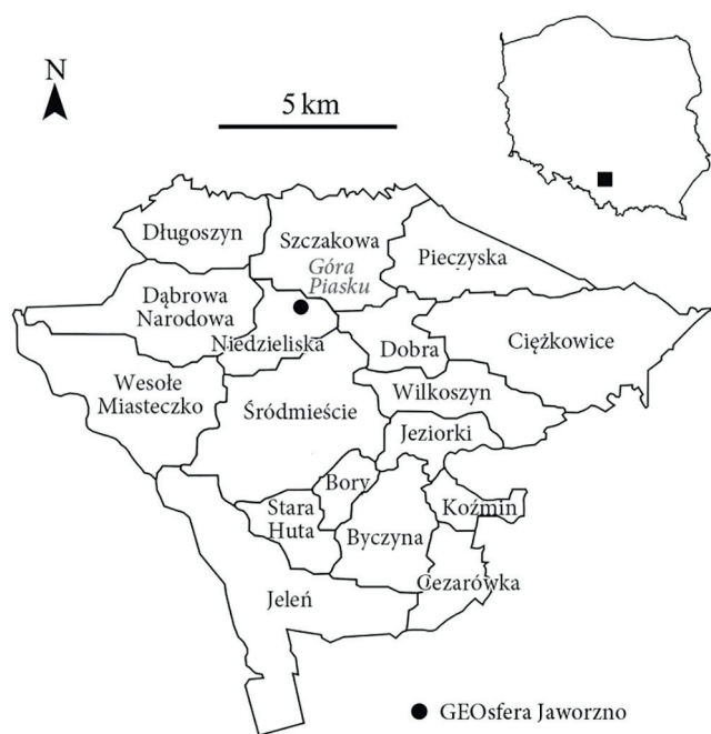
Fig. 1. Localisation of the Centre for Ecological and Geological Education GEOSfera in Jaworzno

GEOSfera is the facility with the total 8 ha of the landscaped area, established on the site of a former dolomite quarry (Fig. 1). Located between Jaworzno city centre and the Sand Mountain, on premises Sadowa Góra. During the Triassic Era, 230 million years ago, this area was occupied by a shallow and warm sea, inhabited by a swimming prehistoric lizard – the Nothosaurus . With time, some dead remains of bivalves, brachiopods and echinoderms settled on the seabed.