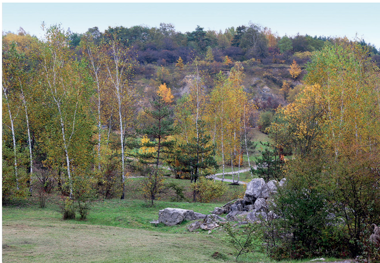
Fig. 3. Quarry walls with spontaneously encroaching vegetation.

Xerothermic grasslands are an inextricable element of limestone areas at GEOsfera. These thermophilic communities consist of the Carthusian pink ( Dianthus carthusianorum ), the spiny restharrow ( Ononis spinosa ), and many others. In places where the terrain is almost flat, sandy grasslands develop fragmentarily on the sandy ground. At GEOsfera, these communities are mainly formed by dicotyledonous plants, i.e. sand thyme ( Thymus serpyllum ), sea thrift ( Armeria maritima ), and field chickweed ( Cerastium arvense ). Meadow communities also develop spontaneously in moderately humid places. Where the permeability of the substrate is lower, e.g. at ripple marks or depressions, temporary stagnant water gathers, thus eliminating species that do not prefer stagnant water.