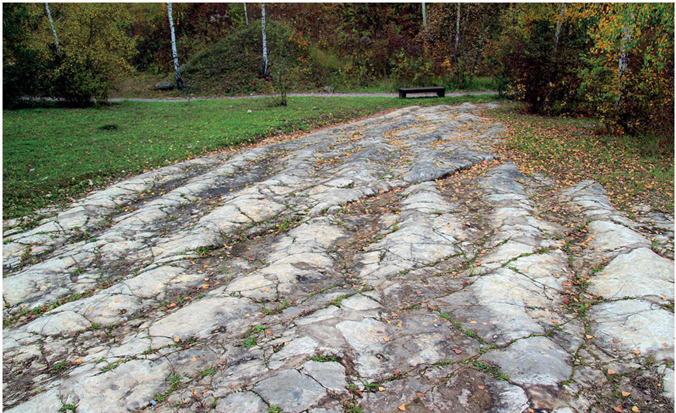
Fig. 2. Mega ripplemarks.

Diverse habitat conditions allowed for the formation of a mosaic of plant communities in this area, from places covered with vegetation consisting of forests in initial stages of development, through shrubs, grasslands and meadows to typically ruderal areas (Fig. 3). In the quarry itself and in its immediate vicinity, 433 species of vascular plants were found (Szendera et al. , 2016). Characteristic elements of this area are thickets of shrubs including blackthorn ( Prunus spinosa ), European buckthorn ( Rhamnus cathartica ) and single-necked hawthorn ( Crataegus monogyna ). Undergrowth and small biogroups of trees are mainly composed of Scots pine ( Pinus sylvestris ) and warty birch trees ( Betula pendula ), species that disseminate thanks to the wind. Slopes with sliding layers of weathered limestone are covered mainly with species of blackberry ( Rubus sp.), but also with spontaneous growth of light-seeded trees such as Scots pine, silver birch and willow trees.