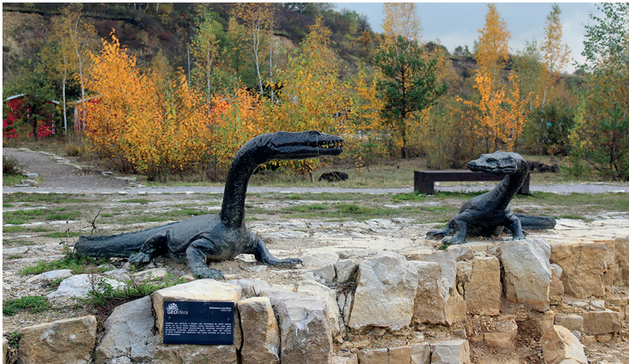
Fig. 6. Nothosaurus models at GEOsfera.