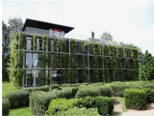
Fig. 1. Green Building in The Botanical Garden, Vilnius, Lithuania

reduces the load on sewage systems [6]. What is more, the use of innovative treatment technologies allows the collection and reuse of stormwater. Today's challenges call for the design and development of smart green infrastructure. Innovative technologies and nature based solutions might be the key factor in order to protect surface water bodies from the negative effects of environment pollution and remove hazardous substances from stormwater before they enter rivers or lakes.