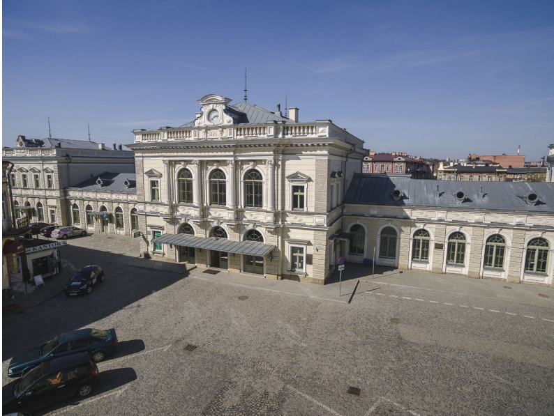
Fig. 4 The main railway station in Przemyśl. A bird's eye view from the south-east.

The development of such a wide-ranging application, covering the vast area of the Przemyśl Fortress located in the area of nine communes of the Przemyśl district (powiat), would not have been possible without the Association of Fortress Communes of the Przemyśl Fortress, established in 2008, associating nine communes of the Przemyśl district 7 . The establishment of the Association made it possible to implement a project of unique scale of developing a part of the Przemyśl Fortress. In the years 2007-2013, the first stage of the project " Development of the historic complex of the Przemyśl Fortress to make it available for cultural tourism " was completed. The cost of the project was 22 071 887.89 PLN, including the amount of eligible costs 20 761 471.39 PLN. The project included works on 24 objects of cultural heritage. Based on forecasts, it was predicted that over 14 thousand tourists would visit the facilities annually. As a result of the project, approximately 20% of the Przemyśl Fortress was made available. These activities were appreciated in 2016 in the competition of the Minister of Culture and National Heritage and the General Conservator of Monuments – Monument Well Cared-for, at which the Association of Fortress Communes of the Przemyśl Fortress was awarded a distinction in the category of revaluation of cultural space and landscape 8 .