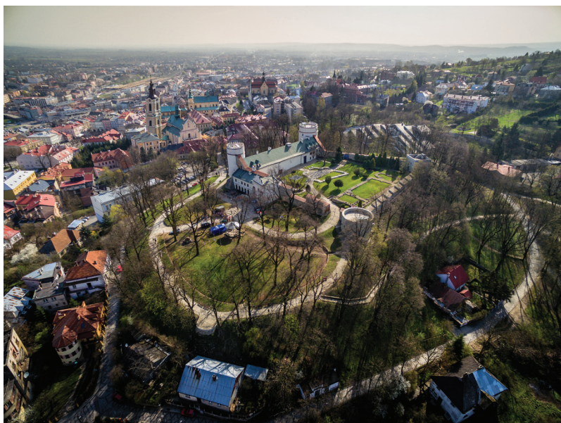
Fig. 1 The castle in Przemysł with a bird's eye view from the northwest. Below the hill, looking from the left, the most important churches: Roman Catholic cathedral with a bell tower, Franciscan church, Jesuit church (now a Greek Catholic cathedral), Carmelite friars church and Carmelite nuns church.