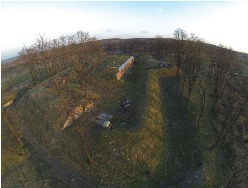
Fig. 3 Fort XV "Borek", bird's eye view. Condition after the revitalization works.

Most questions and doubts concerned the Przemyśl Fortress (1854-1914) 4 . This was related both to the state of preservation of post-fortheistic objects and, above all, to the area, territorial extent and fragmentation of individual smaller and larger fortress works (Fig 3).