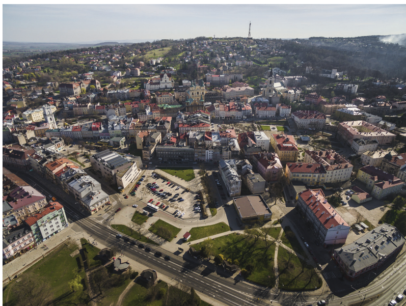
Fig. 2 Przemysł, the old town part, the bird's eye view showing the terraced layout of the buildings. Phot. from the collection of the Municipal Office in Przemysł