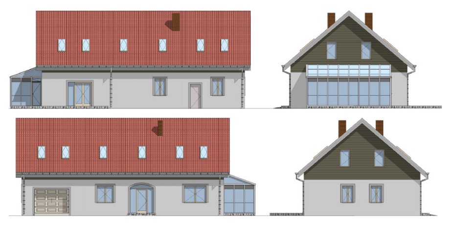
Fig. 1. Design concepts for a single-family residential building with a winter garden -Master thesis: author Krzysztof Polechoński, 2018. (supervisor: PhD, Eng., Arch. Malwina Tubielewicz-Michalczuk). The project was made in the ArchiCAD program for which the author has a license

The article presents the design concept of the master thesis on the example of a single-family house with a built-in winter garden. The student has made detailed solutions of the designed building so that the object meets all current principles and assumptions of building standards as well as heat humidity conditions (Figs. 1 and 2). The work was done in the ArchiCAD computer program (Tubielewicz--Michalczuk, 2019).