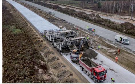
Fig. 2. Concrete pavement using Wirtgen 1900 with the capability of 800 running meters per day.

The concrete pavement set is Wirtgen 1900 composed of a set of 3 machines for pavement, consecutively, the lower and the upper layer and applying the curing agent. The texturing process was performed mechanically by brushing the upper layer in the time of from 12 to 24 hours from the beginning of pavement process.