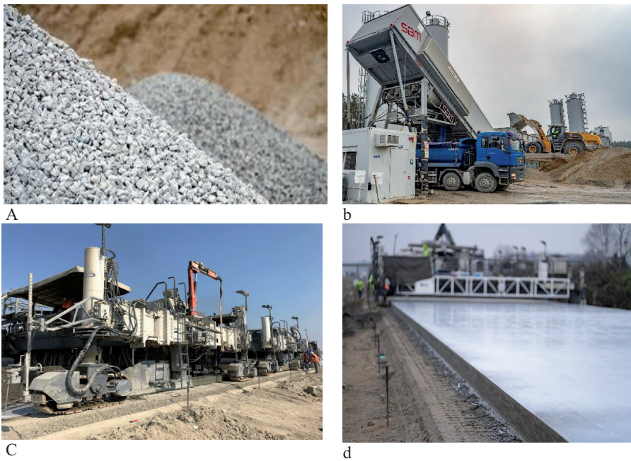
Fig. 3. The supply chain of the concrete mix to the construction site, a-gathering materials, b-production of the mix at the mobile concrete batching plant, c-concrete pavement, d-concrete curing process.

Fig. 3 illustrates the chain links of the supply chain of the concrete mix to the construction site in the analysed case.