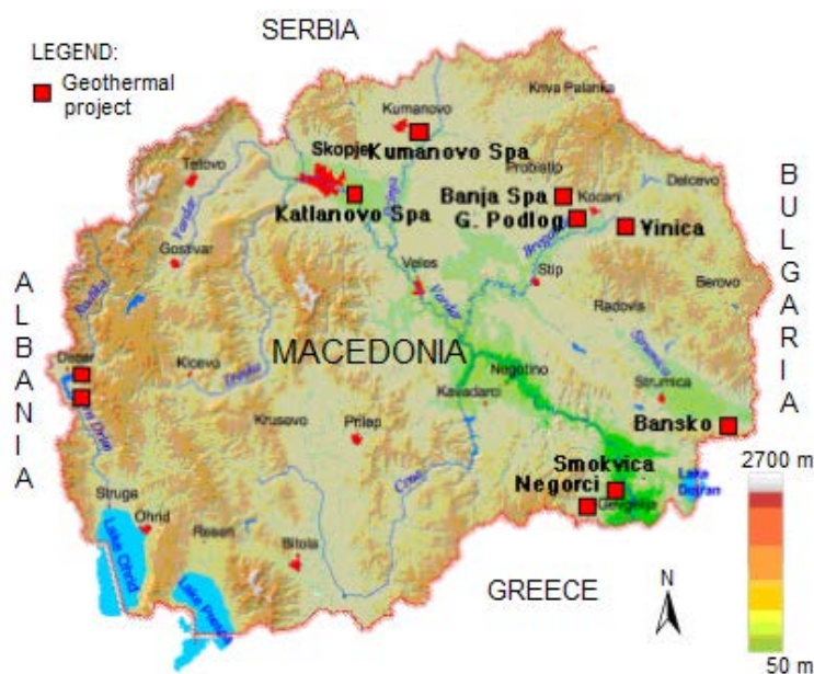
Fig. 3. Location of geothermal projects in Macedonia

There are two geothermal fields in the Skopje valley: Volkovo and Katlanovo spa. There is no hydraulic connection between them. The main characteristics of the Skopje hydro-geothermal system are: maximum measured temperature of 54.4°C and predicted reservoir temperature (by chemical geothermometers) of 80–115°C (Gorgieva 1989); the primary reservoir is composed of Precambrian and Paleozoic marbles; large masses of travertine deposited during the Pliocene and Quaternary period along the valley margins. There are only five boreholes with depths of 86 m in Katlanovo spa, 186 and 350 m in Volkovo and 1,654 and 2,000 m in the middle part of the valley. The last two boreholes are without geothermal anomaly and thermal waters because of their locations in Tertiary sediments with thickness up to 3,800 m. (Gorgieva 2002)