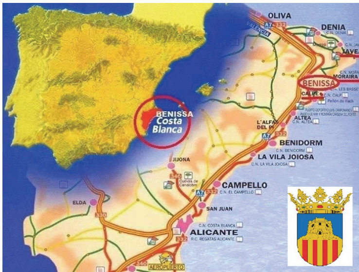
Fig. 1. Municipality of Benissa, Spain (City Council of Benissa)

Benissa is located in the province of Alicante within Valencia region on the Costa Blanca (Figure 1). The town has 10,768 inhabitants (2018 census) with a territory of 69.71 km 2 (Instituto Nacional de Estadística 2018). Benissa's drinking water supply and sanitation network belong to the Municipal Water Supply Council of Benissa.