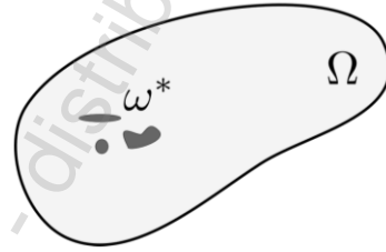
Fig. 1. Body with anomalies

where k_0 \in \mathbb{R}_+ is the electrical conductivity of the background. The sets \omega_i \subset \Omega , with i = 1, \dots, N , are such that \omega_i \cap \omega_j = \emptyset for i \neq j . In addition, \mathbf{1}_\Omega and \mathbf{1}_{\omega_i} are used to denote the characteristics functions of \Omega and \omega_i , respectively. Finally, \gamma_i \in \mathbb{R}_+ are the contrasts with respect to the electrical conductivity of the background k . We assume that the electrical conductivity of the background k and the associated contrasts \gamma_i are known. Therefore, the inverse problem we are dealing with can be written in the form of a topology optimization problem with respect to the sets \omega^* = \bigcup_{i=1}^N \omega_i . See sketch in Figure 1. Let us introduce the following auxiliary Neumann boundary value problem: