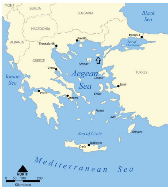
Fig. 1. Gökçeada on map of the Aegean Sea (see arrow), map source: Norman Einstein

were compared with those described in the books and atlases of wood anatomy [Benkova, Schweingruber 2004; Schoch et al. 2004; Akkemik, Yaman 2012], and with those in the reference collection of the Wood Anatomy and Dendrochronology Laboratory of the Faculty of Forestry of Bartın University.