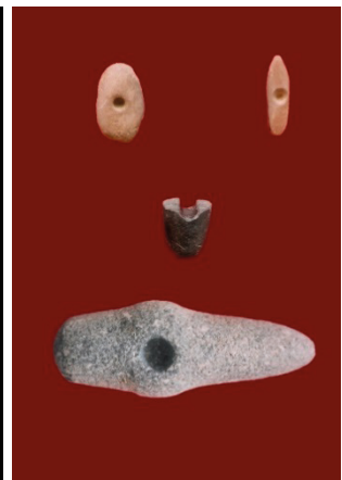
Fig. 7. Stone Axes*