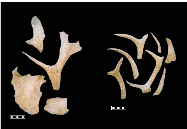
Fig. 6. Deer Bones* (* From excavation archive)