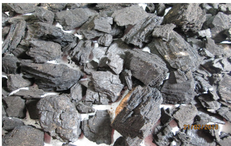
Fig. 2. Wood charcoals from an Early Bronze Age settlement, Yenibademli, Gökçeada