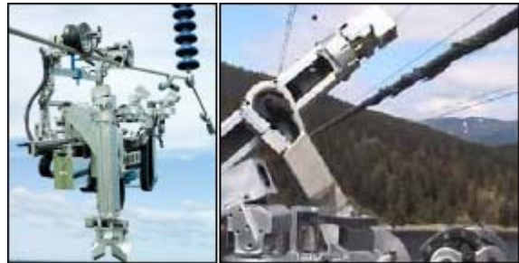
Figure 5. The LineScout robot and the image of a damaged conductor [20]

can overcome all kinds of obstacles and carry out the inspection tasks. The example of such the robot and the acquired image presenting a damaged electrical conductor [20] is shown in figure 5.