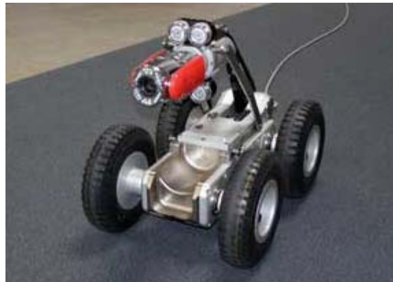
Figure 6. The IPEK vision camera with anti-explosion system [24]

Regarding fuel pipelines, there are similar robots applied (one of these examples is the IPEK vision camera, shown in figure 6), which are put inside the pipes. The IPEK was designed to be adapted to work in hazardous environments with a danger of explosion, so that they are safe to be used for pipelines with a gas or oil. Another example of the research devoted to such kinds of devices were systems introduced by the authors of [21÷23].