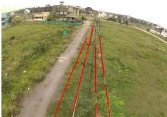
Figure 4. Detected power lines with use of Hough transform [14]

An interesting alternative is the use of the GIS (geographic information system), which allows collecting and storing all kinds of geographical data, such as, in considered case, the position of energy networks units [10]. Another possibility is guiding the vehicles with own-designed system, which recognize the lines “on-line”. Authors of [12÷14] performed the research on detecting the power lines based on the Hough transform and other methods of image processing, like filters and morphological operations application. The Hough transform is a method of detecting straight lines and other regular shapes in the image. Such the transform was invented by Paul Hough and patented in 1962 [15]. An example of this application [14] is presented in figure 4 (the red lines represent the detected power transmission lines).