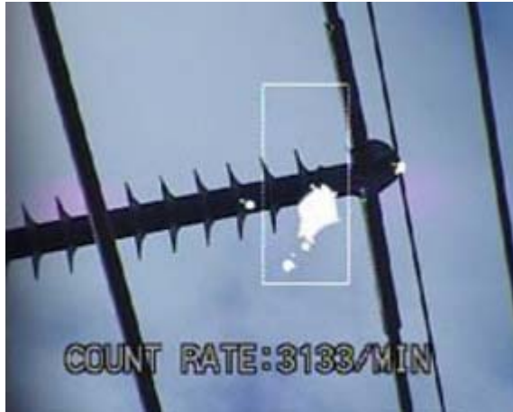
Figure 1. Corona discharge effect detected by an UV camera [5]

polymer ones) as well as corroded (their cores, pins, nuts). Electrical conductors may get torn or broken as a result of a strong wind, heavy snowfall, thick layer of ice, or vibrations [3÷4]. Another important issue is a phenomenon of corona discharges (kind of electric discharges, figure 1), which results in energy loss and accelerated aging of insulators.