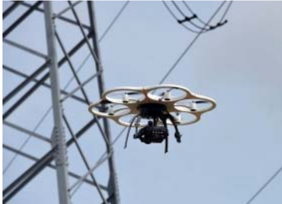
Figure 3. The Aibot X6 drone [11]

Such autonomous devices can be guided on the lines using a known map of the power grids and the system integrated with the GPS (global positioning system).