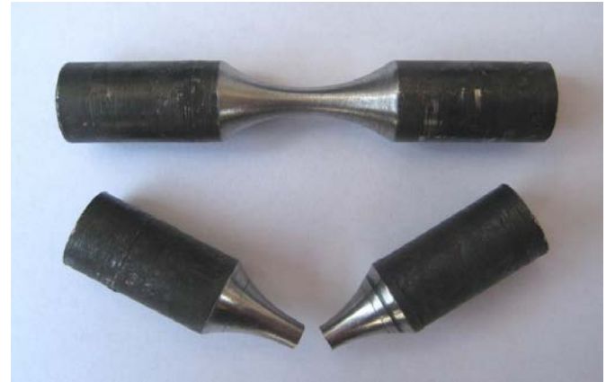
Fig. 2. Ultrasonic fatigue test specimen