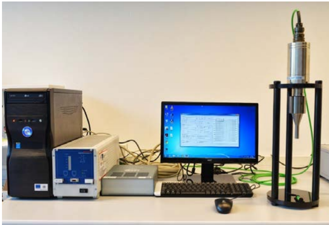
Fig. 1. Ultrasonic fatigue testing device for fatigue testing at f = 20 \text{ kHz}

Experimental works, the quantitative chemical analysis, tensile tests, fatigue test were carried out on the nine structural steels incl. high strength steels (DOMEX 700MC, HARDOX 400, HARDOX 450, 100Cr6). Chemical analysis was performed with the help of emission spectrometry on an ICP (JY 385) emission spectrometer using a fast recording system Image. Tensile tests were carried out on a ZWICK Z050 testing machine at ambient temperature of T = 20 \pm 5 \text{ }^\circ\text{C} , with the loading range in interval F = 0 - 20 \text{ kN} and the strain velocity of \dot{\epsilon}_m = 10^{-3} \text{ s}^{-1} . Round cross-section specimens were used; the shape and dimensions of the test specimens met the requirements of EN 10002-1 standard (3 specimens were used). Fatigue tests were carried out at high-frequency sinusoidal cyclic tension-compression loading ( f = 20 \text{ kHz} , T = 20 \pm 5 \text{ }^\circ\text{C} , R = -1 , cooled by distilled water with anticorrosive inhibitor) and with the use of ultrasonic fatigue testing device, see Fig. 1. Smooth round bar specimens (min. 10 pieces) shown in Fig. 2, with diameter of 4 mm, ground and polished by metallographic procedures were used for the fatigue tests (Trško et al., 2018). The investigated region of number of cycles ranged from N \approx 2 \times 10^6 to N \approx 2 \times 10^9 cycles of loading.