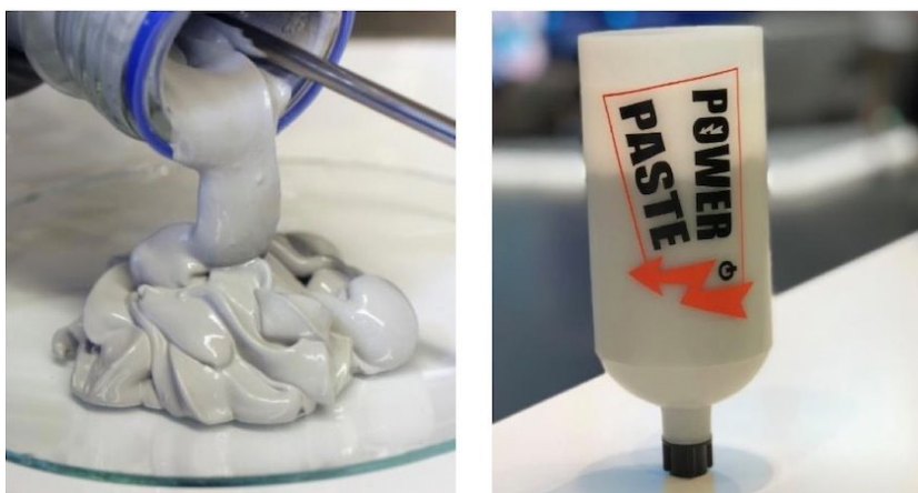
Fig. 1. The innovative material for the accumulation of hydrogen "POWERPASTE" [8, 10]