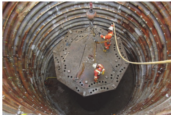
Figure 5. Shaft platform

Once the crane was in place, miners were lowered into the lined portion of the shaft on a platform that closed off the original pilot hole, to drill and blast the opening to the final diameter. After each blast the miners were lowered back into the shaft, where rock bolts and screen were installed, followed by shotcrete placed against the shaft wall. Each FDCP plate was lowered into the shaft and raised into position for bolting to the shaft liner.