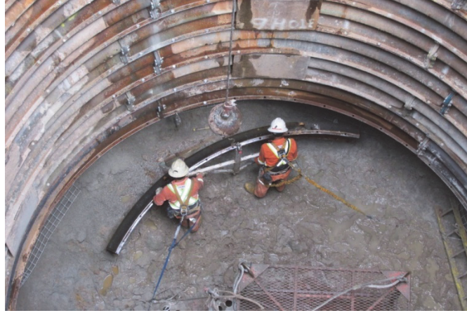
Figure 6. Installing plate

After three rings were assembled, miners would install scribing pins into the shaft wall. The ends of the scribing pins were supported by angle iron attached to the underside of the FDCP liner. Wood formwork was then suspended from the circumferential flange to act as a type of curb ring, or form work to cap off the bottom of the liner (Figure 7. Formwork). Grout was then placed in the closed off cavity. After each grout pour had set, formwork and pins were removed and the cycle repeated itself until they completed the shaft. Once completed, a rail and climber were installed and the shaft was used as a service/vent raise.