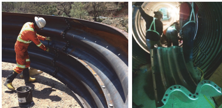
Figure 1. 4 Flange (left) and 2 Flange Deep Corrugated Plate (right)

FDCP differs from traditional deep corrugated plate in that FDCP permits assembly from one side of the structure whereas traditional overlap deep corrugated plate requires access on each side of the plate. FDCP is produced in two flange circumferential, two flange longitudinal (Figure 1), or four flange circumferential and longitudinal seam plate ( Błąd! Nie można odnaleźć źródła odwołania. ). Two FDCP longitudinal is typically used for shafts less than 6 m in diameter as this configuration eliminates the protrusion of circumferential flanges into the shaft, maximizing end area and work space. Additionally, two longitudinal FDCP is more cost-effective for diameters less than 6 m due to a premium cost associated with fabricating a circumferential flange on smaller diameters. Four FDCP is normally used for shafts with diameters greater than 6 m. FDCP material and fabrication criteria are outlined in ASTM A761-16 and CAN/CSA G401-14.