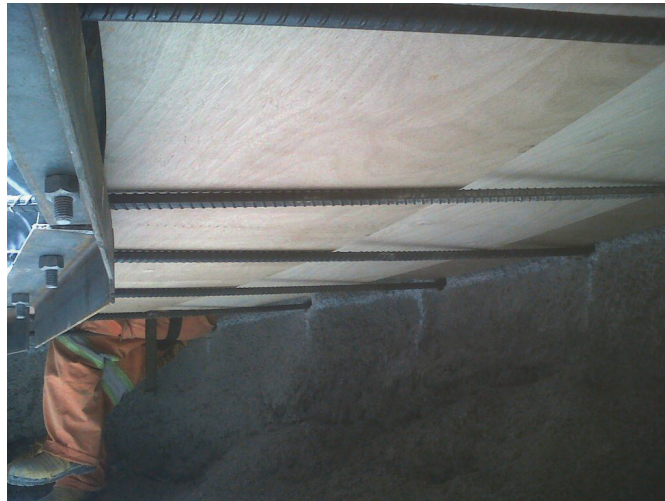
Figure 7. Formwork

After three rings were assembled, miners would install scribing pins into the shaft wall. The ends of the scribing pins were supported by angle iron attached to the underside of the FDCP liner. Wood formwork was then suspended from the circumferential flange to act as a type of curb ring, or form work to cap off the bottom of the liner (Figure 7. Formwork). Grout was then placed in the closed off cavity. After each grout pour had set, formwork and pins were removed and the cycle repeated itself until they completed the shaft. Once completed, a rail and climber were installed and the shaft was used as a service/vent raise.