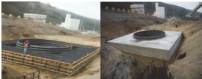
Figure 3. Sub-collar Construction

The structural liner was installed starting at the surface and progressed downward. Miners assembled two complete rings of structural liner, forming a sub-collar, which was then placed directly over the pilot raise opening. From there the sub-collar was levelled using a concrete pad, tied in with a series of rebar to form the overall collar. This gave the rest of the shaft its alignment for advancement.