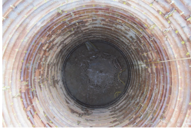
Figure 8. Finished shaft liner