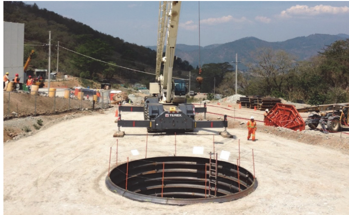
Figure 4. Finished sub-collar

Once the sub-collar was completed, miners installed four more complete rings on the top of the sub-collar, and backfilled the area, returning the site to its original grade. A crane and man basket was then brought in to assist with the rest of construction.