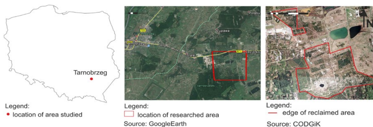
Fig. 1. Location of area studied and general overview

The studies were carried out at reclaimed post-mining sites of the Jeziórko sulphur mine area, where reclamation began in 1993. Of the 2140 ha occupied for mining use, an area of 1179 ha was reclaimed by 2010, of which 705 ha was afforested land. An area of 374 ha was transferred under the management of the State Forests National Forest Holding, of which 332 ha were included in the district managed by Nowa Dęba Forest Inspectorate and 42 ha in that of Rozwadów Forest Inspectorate (Pietrzykowski et al. 2012).