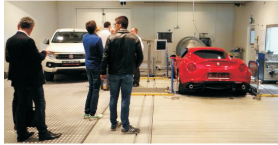
Participants during the coffee break, viewing the climatic chamber (with 4WD chassis dynamometer) at BOSMAL

the full WLTP [procedure] improves the situation somewhat (mainly due to the redefined test inertia), but the road-laboratory gap has not yet been closed when it comes to CO 2 /FC. A number of questions asked in the summary of the opening presentation were touched upon and answered by presenters in further presentations. These theses for further discussion were: