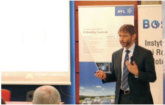
Prof. William Northrop (University of Minnesota, USA) during his presentation on particulates from low temperature combustion

legal requirements for type approval in Europe. In order to protect some engine and aftertreatment components, certain systems may be deactivated under certain conditions (e.g. EGR at cold start). In the EU, such control strategies are manufacturer secrets, while in the US such actions must be authorized. Federal US legislation also requires that vehicles are tested over multiple driving cycles, which include hot starts – in contrast to the EU, where there is one test cycle which always commences from a cold start. (This is another example of the thoroughness with which US emissions limits are enforced, for the time being without resorting to RDE testing.)