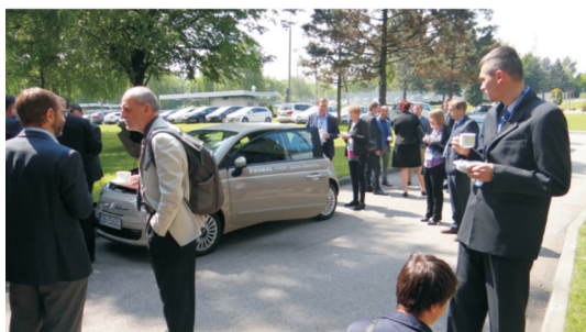
Guests during the coffee break, in the background the 500e electric car developed by BOSMAL

used by TÜV Nord is 83 km long and the test lasts 105 minutes (i.e. mean speed 57 km/h – higher than the equivalent values for WLTC and the NEDC).