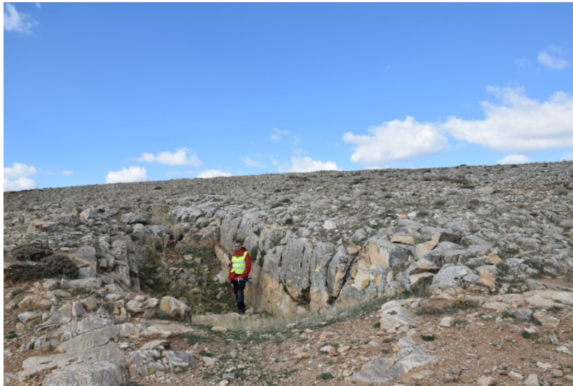
Fig. 1. Antique searching trench.

Starting discussion on this issue, we should consider what problems antique miners encountered during the start of operation and later during its gradual development. The first and fundamental was finding and recognizing rocks having qualities for architecture and construction purposes, in line with the prevailing architectural style. These process was long and multigenerational, limited by lack of good roads and communication. Civilizations such as the Roman and Byzantine benefit from the knowledge and findings of earlier civilizations (Fig. 1).