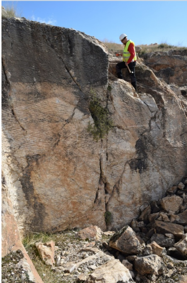
Fig. 5. Ancient pit wall with visible traces of pickaxes.