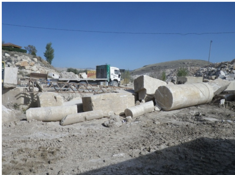
Fig. 6. Heap of ancient blocks and columns in the modern quarry.