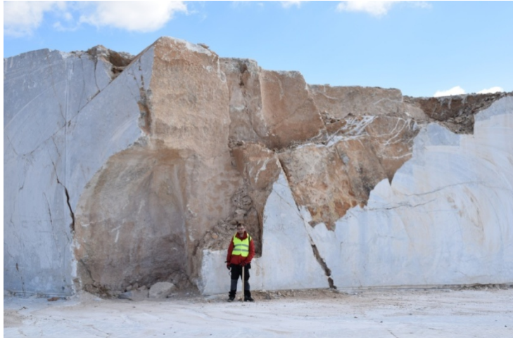
Fig. 7. The remains of carving arc.

The way of export of these beautiful marbles began in quarries in Dokimia from where they were transported to a local administrative center in Synada (today Suhut). Synada lies about 40 km from quarries in Dokimia. In this city there were the main warehouses of architectural and artistic products, it also served as the head office. From here the products were sent as ready-made