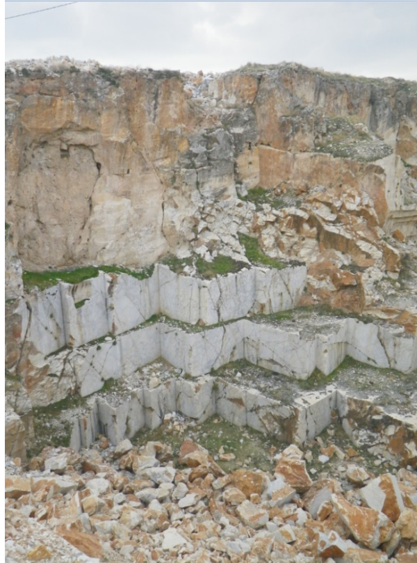
Fig. 4. Wall of abandoned quarry. In the upper part there are visible traces of ancient mining. In the lower part there are visible traces of contemporary works.

geological structure of the massif to a depth of 8 m. Below this zones there is another one reaching a depth of 25-30 m below the surface which includes the fractures related to hydrothermal veins (Fig. 4).