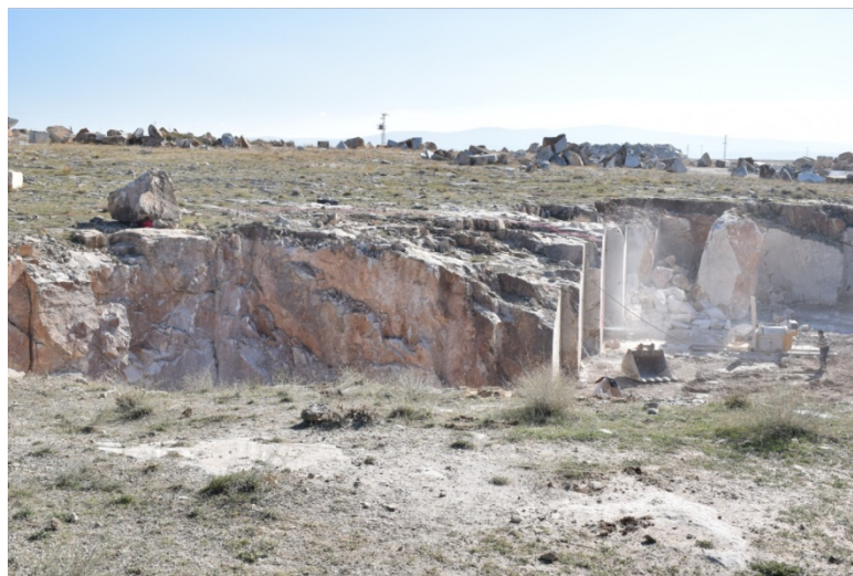
Fig. 3. Saw rope cutting process.

plan the order of breakout. Without first defining plan we lose facilitating work gaps very quickly. Construction of artificial discontinuities in the rock is time consuming and expensive. Planned economy used in the area of Iscehisar today eliminates this problem by using solutions such as a saw rope and chain saws (Fig.3). These machines makes formatting blocks easy, and their detachment does not pose a big problems. The Afyon region is known as one of the most important marble production and processing centres in Turkey. "The Afyon province, which possesses 3.5% of exploitable marble reserves (3,872,000,000 tonne) in Turkey, yields 9% of the total marble block production. The 409 marble processing plants in Afyon produce 19% of the total slab in Turkey" [1].