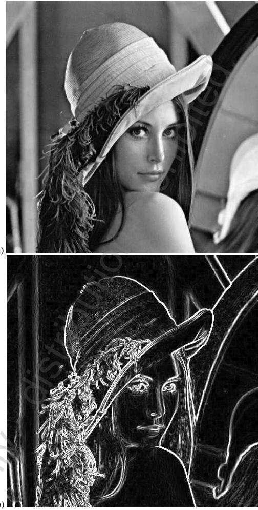
Fig. 1. Result of work of the modified Sobel operator: a) input image; b) output

function [y x metric] = CalculateMotionBlur- rCurve(image) image = ApplySobelOperator(image, true, true); image = mat2gray(image); [n, m] = size(image); gropWidth = 5; image = image(gropWidth:(n-gropWidth), gropWidth:(m-gropWidth)); len = 9; step = 1; x = zeros(1, 180/step + 1); y = zeros(1, 180/step + 1); for i = 0:(180/step) degree = i * step; h = fspecial('motion', len, degree); conv2im = conv2(image, h, 'same'); y(i + 1) = -log(mean2((image - conv2im).^2)); x(i + 1) = degree; end t = median(y); metric = abs((max(y) - t) / (t - min(y))) * var(y); end