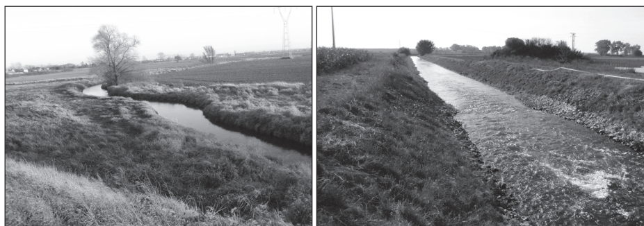
Fig. 2. The channel of the River Struga at its confluence with the Odra (left) and below the mouth of the pipeline from the Tarnów Opolski mine (right)

The Struga joins the Odra on its right bank at km 145.35 in the region of the villages Przywory and Grotowice (Fig. 2). The total surface area of its drainage basin is 41 km 2 . This basin includes several small watercourses and drainage ditches. The adjacent land consists of meadows, pastures, forests and arable land. The river starts at the mouth of the old pipeline which evacuates water from the mine. Part of the drainage basin dried due to the cone of depression formed as a result of aggregate mining. In the 1980s, some river regulation works were carried out on the Struga. Its channel was considerably widened and deepened. These works changed the conditions of water infiltration from the river to the ground. Apart from it, the flow capacity of the channel increased considerably. Measurements carried out by the authors in the drainage basin of the Struga prove that abundant rainfall has no influence on the increase of flow along the watercourse. The run-off of water at the start and at the end of the river remains the same and in some periods even decreases. This is caused by the specific geological structure of the river basin. A considerable increase in the run-off rate in the river over the last several years results from its widening and deepening and is also caused by the very good hydraulic conditions (systematic maintenance and strengthening of the river channel).