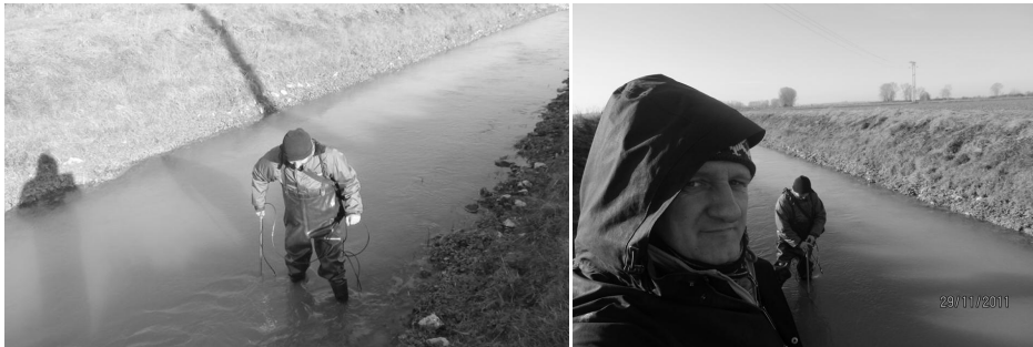
Fig. 4. Velocity and flow rate measurements on the Struga river

Rys. 4. Pomiary prędkości i przepływu wody w rzece Strudze