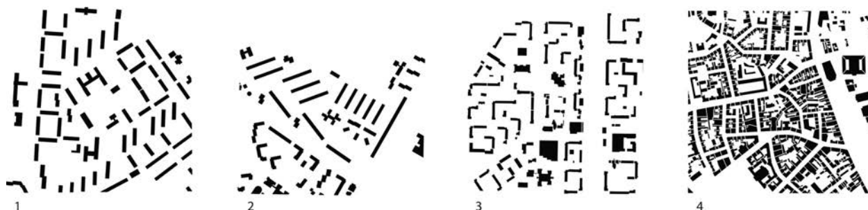
Fig. 1. Comparison of urban tissue fragments of Lviv built in different periods: (1) 1950s, Vyhovs’koho Str. – Liubins’ka Str.; (2) 1960–1970s, Hrinchenka Str. – Hmelnyts’kogo Str.; (3) 1980s – housing estate Sykhiv; (4) – historical core of Lviv

Infrastructural questions also became more sharpen. The amount of existing public facili-