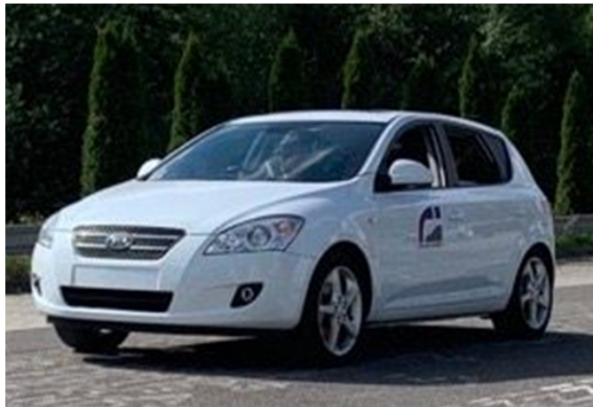
Fig. 2. Kia Ceed, the tested vehicle at the University of Žilina

As part of the research, practical measurements were carried out at the University of Žilina (Slovak Republic), specifically with the Department of Road and Urban Transport, to quantify the chosen operational features of the vehicle under laboratory conditions while accelerating in various height profiles of the road (flat 0.00%, uphill -8.5% and downhill 8.5%). The experiment included five vehicle accelerations on a flat surface, five downhill accelerations, and five uphill accelerations. The vehicle tested in the laboratory was the Kia Ceed (see Fig. 2). Table 1 presents its technical parameters.