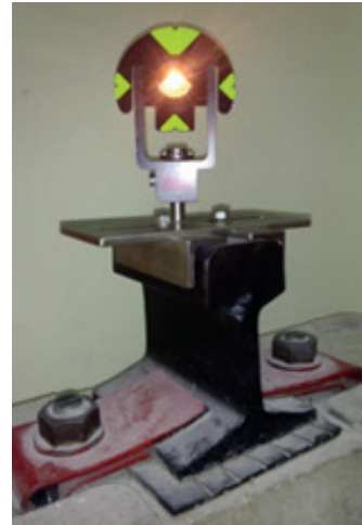
Fig. 1. Clamp with central point and mini prism

method described in [6, 11] to solve the problem in the local 3D reference system. The estimation method used to calculate the rectification corrections for crane rail axes is the parametric method with conditions imposed on parameters (for instance [3, 19, 20]). The quoted references analyse in detail the issue of calculating corrections for crane rail axes in 3D, and include simulated real cases referring to different types of overhead cranes. Since calculating corrections is not the main subject of this paper, only basic assumptions of this method are presented here.