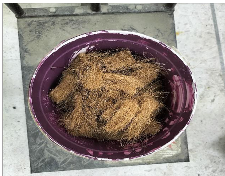
Figure 2. Coconut fiber threads