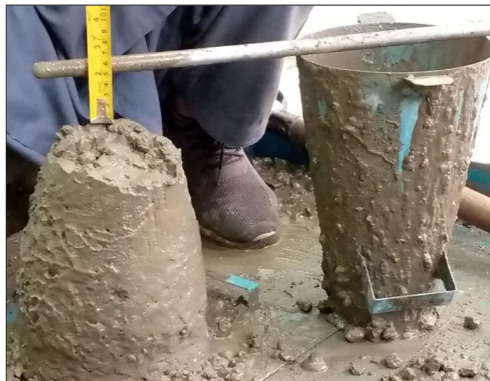
Figure 5. Slump of concrete

This volume of concrete has varied amounts of coconut fiber reinforcement 3%, 6%, and 10% added to the volume of concrete. However, low operability is noted when the fiber is added to the mixture. In order to create a concrete mixture with the appropriate operability, super-plasticizers were thus added to cement in various proportions. After 24 hours of casting, the cubes and cylinders were demolded and thoroughly cured in a curing tank for 14, 21, and 28 days. After 14, 21, and 28 days of curing, the cubes and cylinders were removed from the