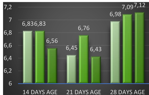
Figure 9. Compression-strength of concrete cube specimen with 6% of coconut fiber concrete