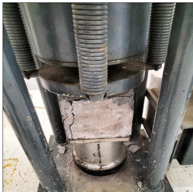
Figure 7. Compression testing cube failure