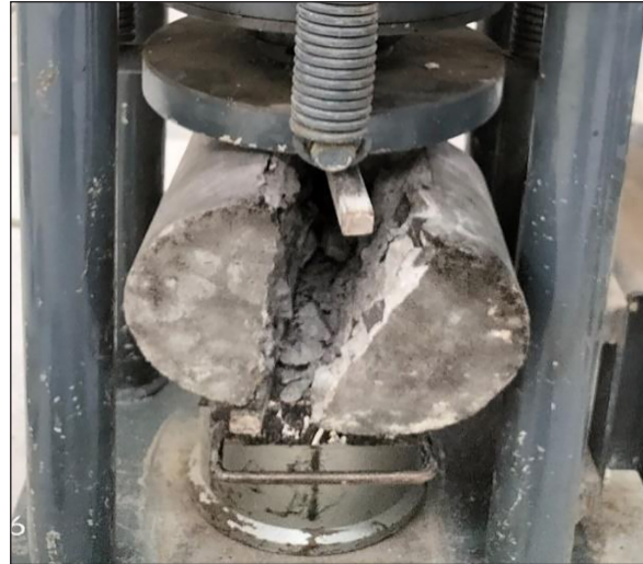
Figure 12. Splitting tensile test specimen failure