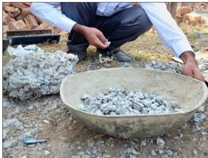
Figure 1. Recycling of aggregate

This experimental work includes processed coconut fiber. Fiber treatment eliminates dust particles and other impurities that have been left on the fiber to improve the surface of contacting between the fiber and the mix, leading to a stronger bond between the reinforcement and the concrete to reach maximal high strength. The fiber length is 50mm (5cm), shown in Figure 2, and properties are presented in Table 1.