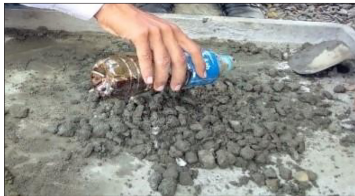
Figure 3. Mixing of concrete

Before pouring the concrete, the molds were oiled from the inside. To achieve the strength of cubes better poured the concrete in the cubes in three layers, each of which was compacted by 25 rod strokes as shown in figure 4. Total of 12 cubes and 12 cylinders of concrete including Normal and RAC were prepared according to the same procedure described above. The 3 cylinders and cubes consist of normal concrete and the remaining cubes were prepared at different ratios like 3%, 6%, and