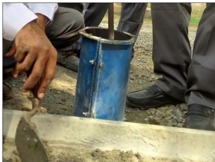
Figure 4. Casting of concrete