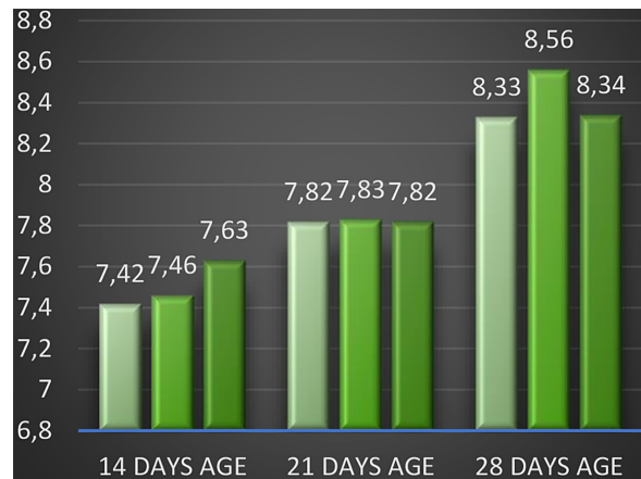
Figure 8. Compression-strength of concrete cube specimen with 3% of Coconut fiber concrete

Reinforced concrete is poured with 3%, 6%, and 10% of coconut fiber CF added in cement, to obtain the value and compressive strength of plain cement concrete. From Tables 6, 7, and 8 the trend is observed that when adding 3% of coconut fiber the maximum average compressive strength of concrete is 8.41 MPa at 28 days age, 6% coconut fiber average compressive strength at 28 days age is 7.063 MPa and 10% addition of fiber average compressive strength at 28 days age is 5.82 MPa. It was further observed that each specimen from a different group achieved maximum strength at 28 days of age. When additional fiber is added, pressure resistance values are substantially lower compared to normal plain concrete. The creation of transition zones causes a weak area around the fiber making the sample weak. The difference