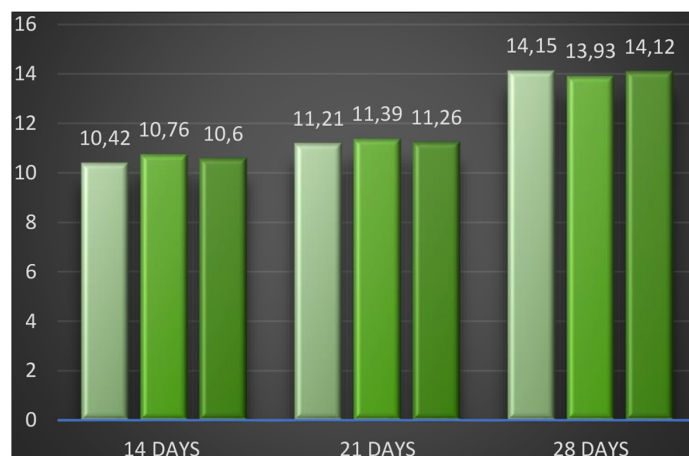
Figure 6. Compressive-strength of normal plain concrete