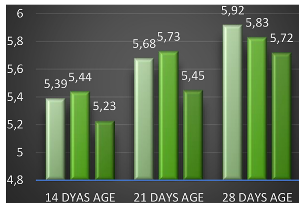
Figure 10. Compressive strength of concrete with 10% coconut fiber concrete

between plain concrete and fiber-added recycled aggregate concrete is shown in Figure 13.