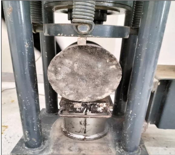
Figure 11. Splitting tensile test on cylinder specimen