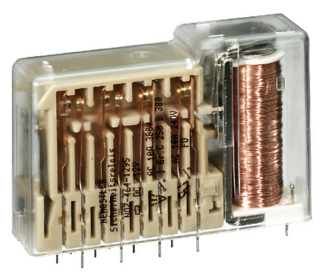
Fig. 1. Overall view of the H-464 type relay with eight contacts

Relays of the H-464 type are manufactured for direct current voltages: 6, 12, 24, 48, 60, 110 and 220 V. The maximum current-carrying capacity of the contact during switching-on equals 10 A, while its minimum continuous temperature load equals 5.1 A. Typical values of the operating time of the H-464 type relays are: