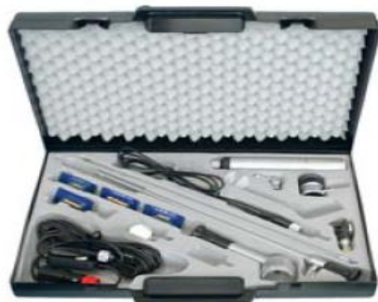
Fig. 5. A complete endoscope set