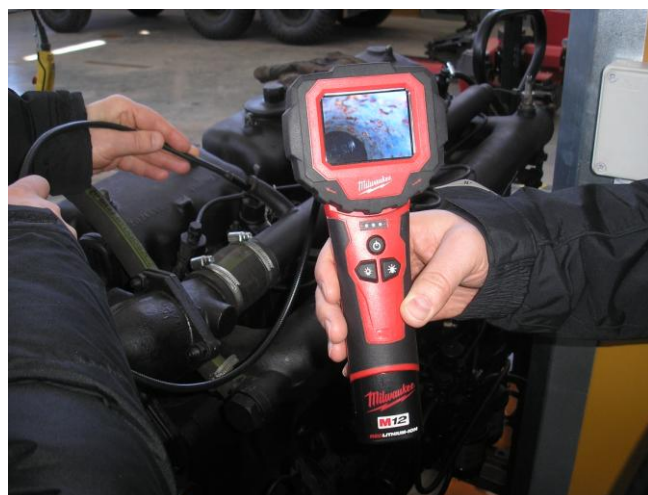
Fig. 7. A view of the end of a pipe