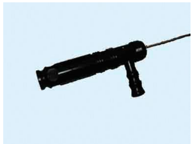
Fig. 2. A general view of a borescope

Borescopes with zoom and movable prism consist of a metal handle and a stainless steel pipe, they are precise optical devices, fig. 2 [9] and one has to be careful when using them and properly maintain them. The construction and operations of a stiff borescope are shown on fig. 3 [9].