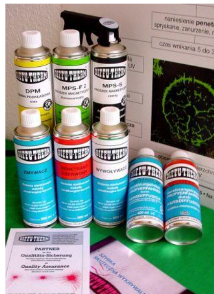
Fig.1. Various types of penetrants

In the case of penetration testing, the most often used types of penetrants are colored (red) or fluorescent penetrants (Fig. 1 [9]). If a fluorescent is used, in order to cause fluorescence, and thus revealing surface irregularities in the given material, ultraviolet lamps are used.