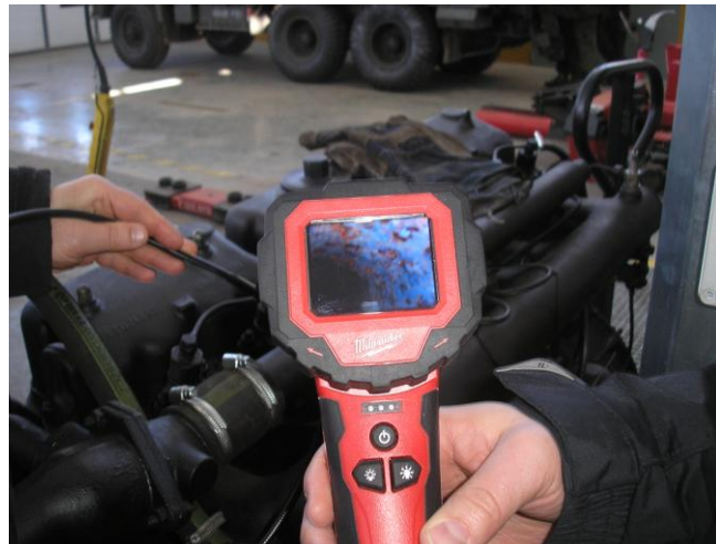
Fig. 6. A view of the inside of a pipe

With this type of testing, both the internal and external structure of the construction material [2] is visible during the testing like through a magnifying glass, appropriately enlarged, which enables quick identification, recognition and potential assessment of the occurring defects or material faults.