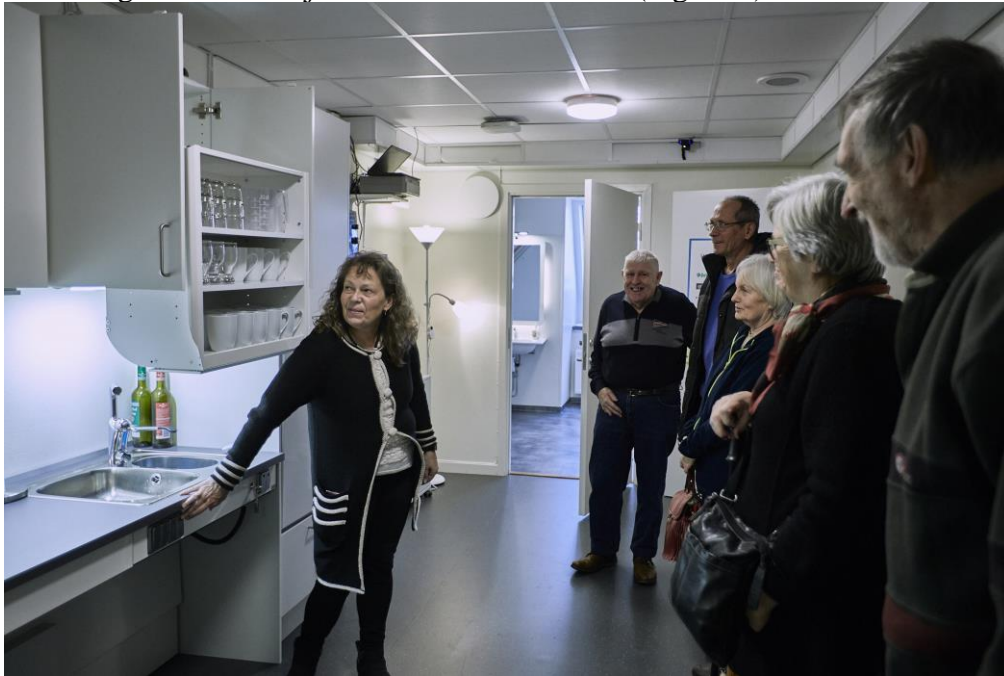
Figure 1. Adjustable interior of kitchen cabinets in the exemplary AAL (Ambient Assisted Living) facility apartment in the Skaraborg Health Technology Centre in Skövde, Sweden

for the elderly than for young people as a result of decreasing height in the elderly. Hrovatin et al. (2015) point out that if illnesses restricting joint movement are also taken into consideration, height accessibility would be even lower. The solution to this design challenge could be providing a range of adjustment features to the furniture. An inspiring example can be found in the Skaraborg Health Technology Centre (SHC) at the University of Skövde which is an exemplary demo arena of a senior-friendly assisted living facility apartment. It showcases among others the adjustable kitchen furniture (Figure 1).