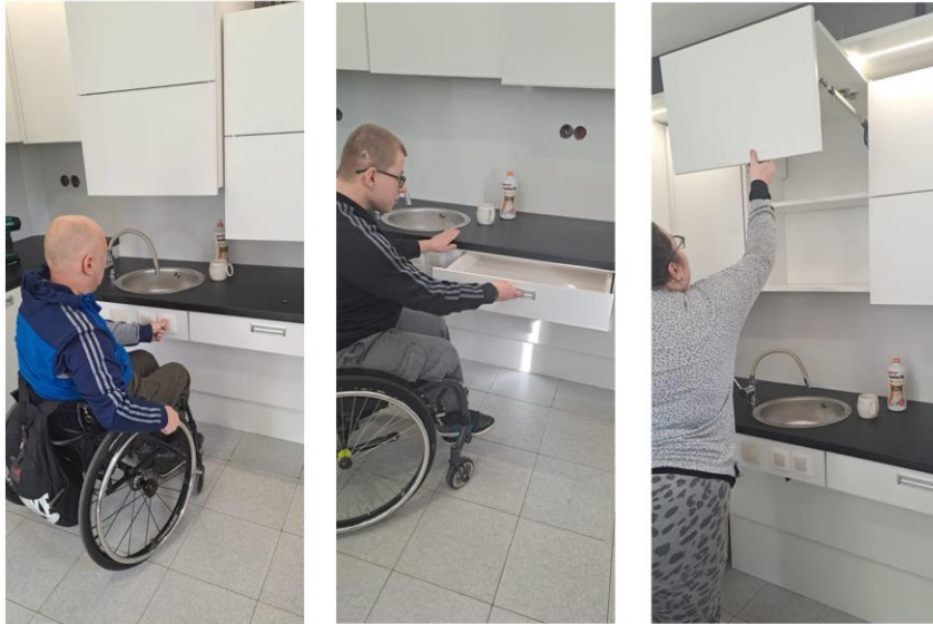
Figure 4. The field tests of the developed prototype

point out that designing kitchen furniture with adjustable shelves or pull-out drawers can improve accessibility and reduce the need for head extensions. At the same time, it confirms the benefits derived from the presented new product design. Implementation of the SERVQUAL method in the studies confirmed that the participants of the tests highly evaluated the accessibility and functionality of the developed solution. The mean evaluation, calculated based on 200 responses, reached 4.52 in both cases. It is worth highlighting that the participants evaluated the solution based on their own experiences derived from using the furniture by themselves (Figure 4).