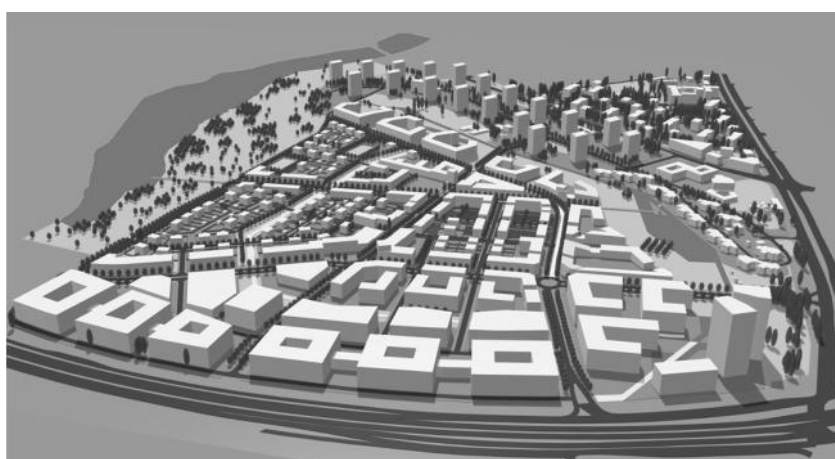
Fig. 3 Conceptual urban design for the analyzed area

The analysis was performed for a newly designed urban unit of Czerniaków South district, delineated in the capital city of Poland. The urban and architectural design of the area was prepared by SOL-AR company. The analyzed urban unit is located in the south-western part of Warsaw, in the district called Mokotów with the area of 54 ha and planned density of population 163 persons per hectare. The green areas take up 11.7% of the total, the whole urban unit is located in the vicinity of a valuable green belt of the Vistula river, the Czerniakowskie lake nature reserve and a nearby park.