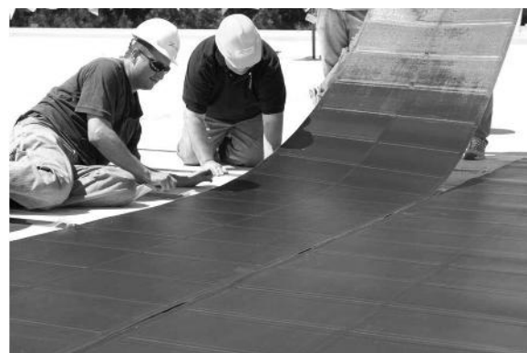
Fig. 2 PV technologies chosen for calculations