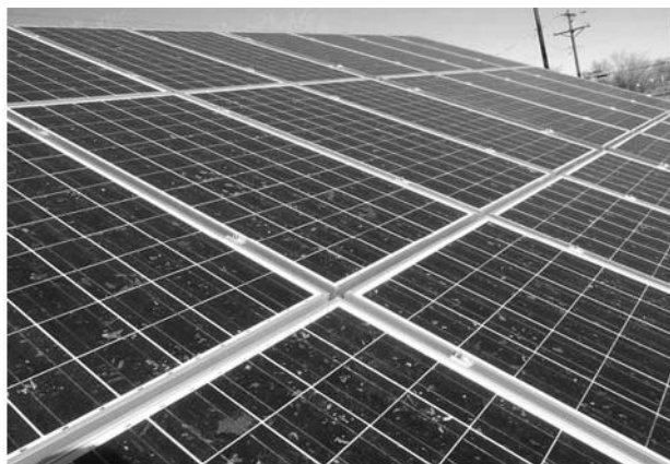
polycrystalline solar cells (mc-Si)

For the analyzed urban unit only two market well established PV technologies were chosen for further calculations: traditional polycrystalline solar cells (mc-Si) and a thin film amorphous silicon (a-Si) technologies (Figure 2). Additional assumptions refer to the decline of PV efficiency in time assuming the rate of 0.5% annually. Later climatic and technical data were used to calculate energy generation in a 20 year perspective (Figure 3).