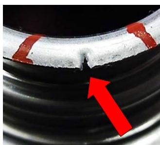
Fig. 5. Cover (crack)

Operators of pressing machines and workers of 100% control are ordered to separate units if there were found minimally 10 n. i. o. pieces of unit with the specific type of fault (burr, crack...). These pieces are separated with description (the number of unit, the amount of units), marked fault on the surface and placed nearby pressing machine (in red box) that produces this unit. On the workplace of 100% control, it is placed in the container which is given for this order. It is important to take a photo of the unit, the date code and the fault and it has to be admitted to defined cell – Fig. 5. If the unit, addressed to photo documentation of the fault, is not placed on pre-defined place, it is needed to closely specific defined fault. For example, the dialog with the operator who made the mistake or controlled it on the workplace of 100% control and report it to the cell could be useful. Examples of faults from photo documentation: