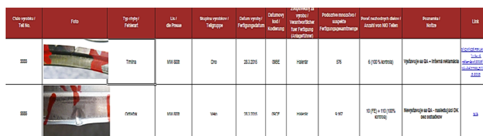
Fig. 4. Table of internal quality

The highlighted part of the table 9 (3333 – cracks, 5555 – fingerprints) are necessary to report to the Table of internal quality (Fig. 4). It is written to the table – the number of the unit (3333), the fault of the unit (crack), the type of pressing machine (MW 800 t), the name of the unit (head), the date of producing (28.03.2015), the date code (09BE), the name of operator (Halenár), the numbers of produced units. There are also information if the Quality Alert (Quality report + Internal complaint) will be making out, link to automatic connection to the system and re-searching for Quality Alert.