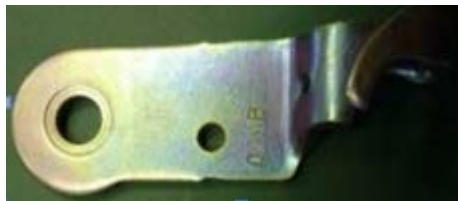
Fig. 2. Control lever