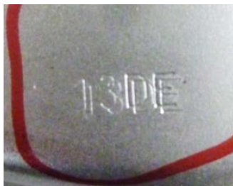
Fig. 7. Head (failure operation/unreadable DK)