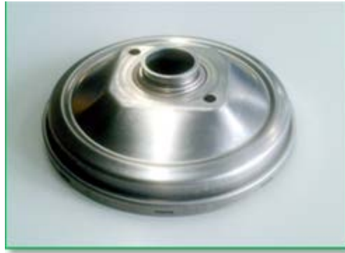
Fig. 1. Cover

control lever or cable support, are made by processed machines. The example of a small piece is in Fig. 2.