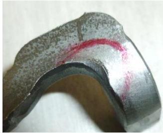
Fig. 6. Lane support (deformation)