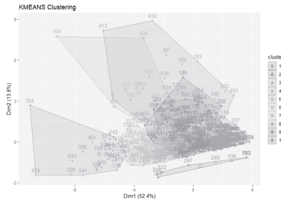
Wykres 3. Układ wydzielonych grup.