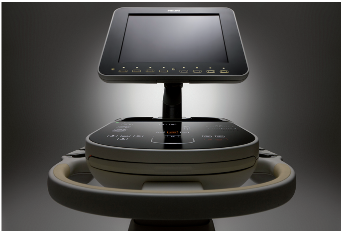
Figure 9. Philips Sparq

This is another ultrasound device (see Fig. 9) whose compact design allows us to classify it within the “point-of-care” (POC) segment, which means that the medical equipment can be delivered to the patient’s bed for the duration of examination and is easily transported to new places. The large 17-inch screen mounted on a movable arm has a positive effect on the clarity and visualization of the presented data and can be useful in various conditions of usage. The device uses SonoCT technology, which reduces image artifacts from the probe, and XRES technology, which removes interference and ensures greater readability of the signal. The manufacturer decided to use a flat-glass surface with no physical buttons, which reduces the likelihood of infection and provides easier cleaning of the equipment.