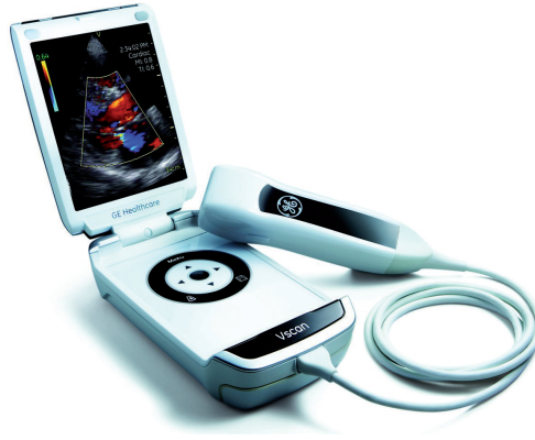
Figure 3. GE Healthcare™s Vscan 3 .

With intuitive user interface solutions, the device can be operated with only the thumb of one hand. The control panel consists of a small number of buttons and is touch-sensitive, which could be helpful for regulations of specific parameters.