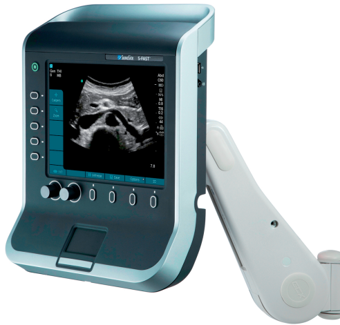
Figure 5. Sonosite S Series Ultrasound System 5 .

SonoSite S Series devices (see Fig. 5) can be mounted on a wall, ceiling, or wheelchair, making them portable and convenient to use in various places. The device is controlled by knobs and buttons located near the monitor (the operation of which depends on the context of use) and is configurable. This allows users to adjust the operation of the interface elements to their individual needs, providing abundant flexibility when operating the device.