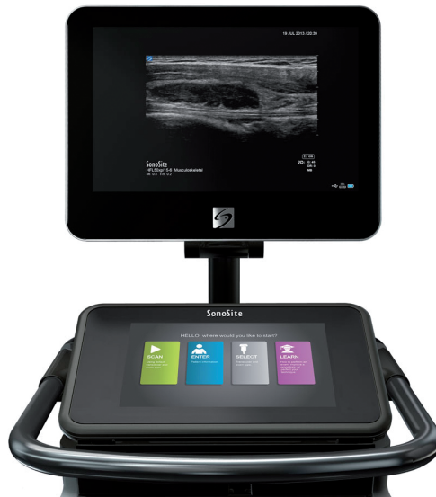
Figure 7. SonoSite X-Porte 7 .