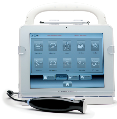
Figure 2. MobiSante MobiUS TC2 2 .

MobiUS TC2 (see Fig. 2) uses a tablet instead of a smartphone, which offers a larger workspace.