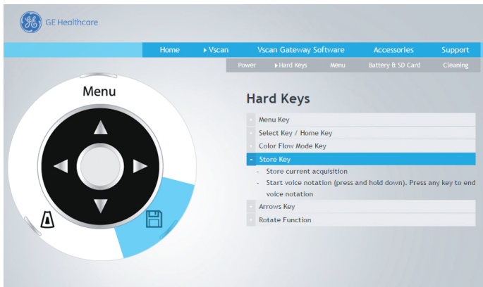
Figure 4. GE Healthcare™s Vscan tutorials 4 .

In addition, the manufacturer offers very extensive educational materials on the website, consisting of visual guides, interactive instruction, and simulations. These help to quickly familiarize users with its operations.