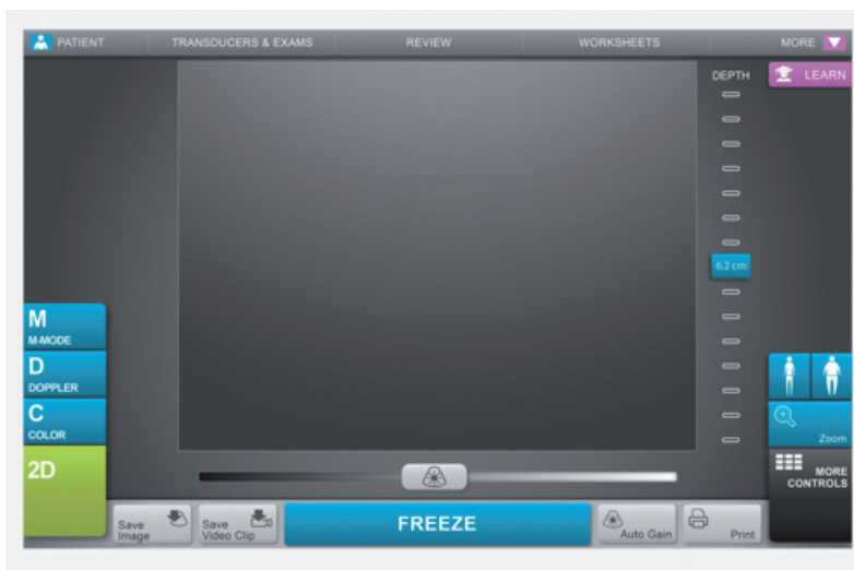
Figure 8. SonoSite X-Porte user interface 7 .

The small width of the unit makes it easy to move even in tight spaces. Thanks to the possibility of closing the main screen, the device is more compact and is protected from accidental damage during transport.