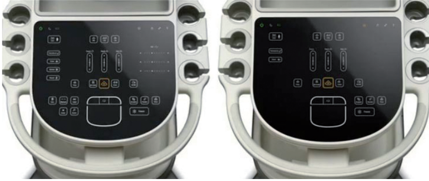
Figure 10. Philips Sparq control panel 8 .

nation. The device provides a set of guidelines for the examination (SmartExam) and automates system functions to suit current needs. Simplicity Mode allows the user to leave active (visible) only those options in the control panel that are most-commonly used.