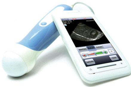
Figure 1. MobiSante MobiUS SP1 1 .

MobiUS SP1 (see Fig. 1) uses a Toshiba TG01 smartphone running under Windows Mobile 6.5. The device does not have the typical features of a mobile phone, but thanks to the Wi-Fi module and GSM communication, it can (for example) share and transfer saved photos to the base hospital for further consultation/archiving. The device also saves images to the memory card. It can be also connected to a computer. The small size makes it ultra-mobile, and its relatively low cost can certainly affect the popularization of this type of equipment. Interface solutions recall mobile operating systems – large buttons and icons on the touchscreen are easy to read and use.