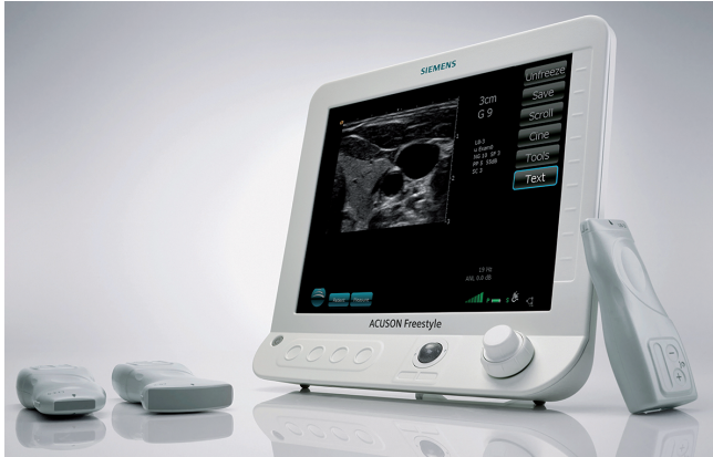
Figure 6. Siemens ACUSON Freestyle Ultrasound System 6 .