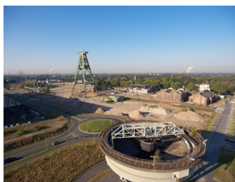
Fig. 6. Kreativ.Quartier Lohberg. Overview.