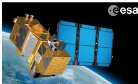
Fig. 3. Sentinel 2A. Rys. 3. Sentinel 2A.