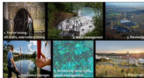
Fig. 2. Examples for Risk Fields in Post-Mining. Rys. 2. Przykłady pól ryzyka w zagadnieniach związanych z terenami pogórnictwa.

nical possibilities for low-temperature electricity generation from warm mine water. Scientists are developing such technologies for this request.