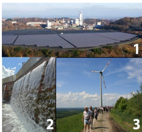
Fig. 5. Creating renewable energy, an opportunity of post-mining. 1) Photovoltaic plant on a mud pond; 2) Heat from mine water; 3) Windmill on a dump hill. (14)