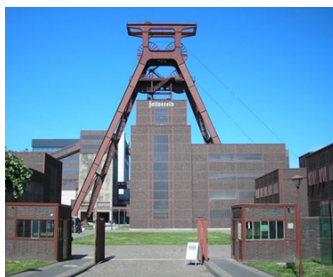
Fig. 4. Industrial monument: pit frame head of shaft XII of colliery Zollverein. Rys. 4. Zabytek techniki: wieża szybu XII kopalni Zollverein.