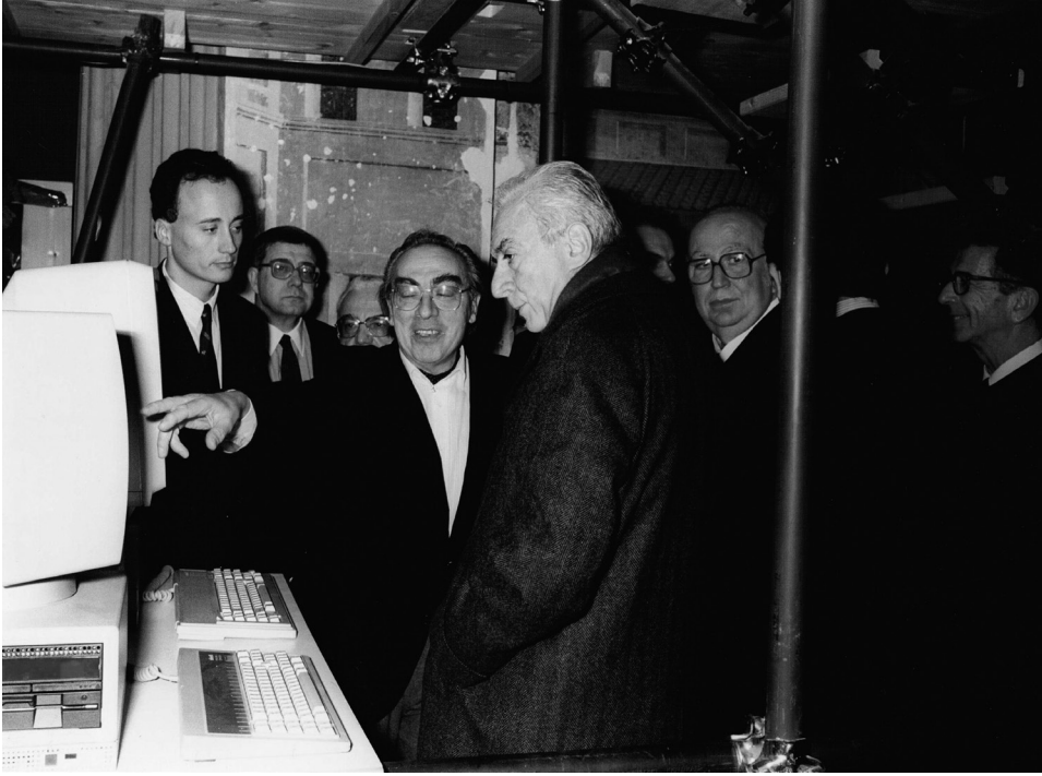
Fig. 1 Umberto Baldini with Francesco Cossiga President of the Italian Republic, Giovanni Spadolini President of the Italian Senate and former Prime Minister, Massimo Bogianckino Mayor of Florence (end of the 1980es)