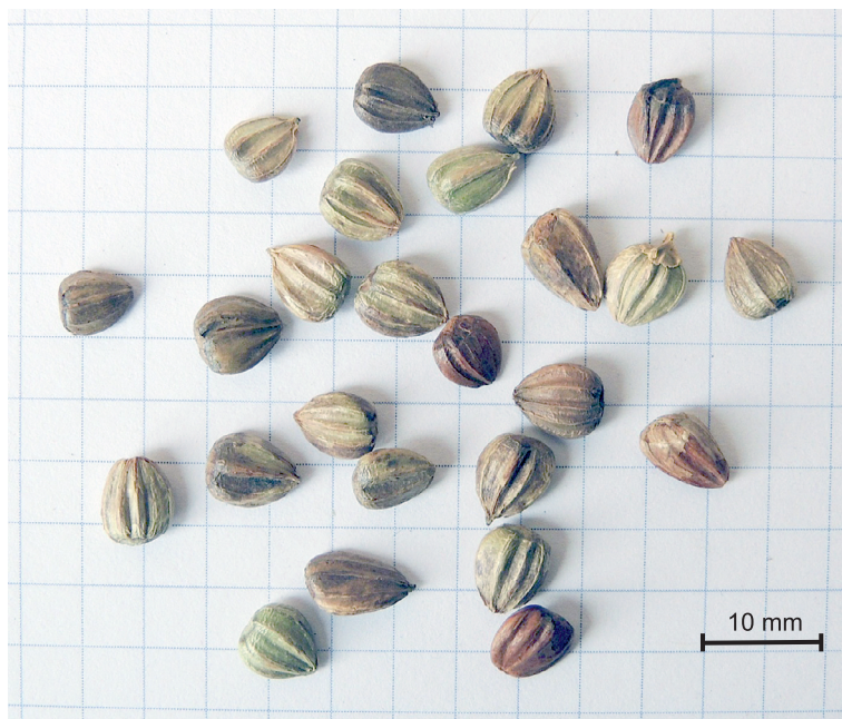
Fig. 1. View of common hornbeam nuts

dormancy, and it involves warm and cold stratification over a period of 18–20 weeks (SUSZKA et al. 2000, MURAT 2002, CZAPRACKI, HOLUBOWICZ 2010, ZHU et al. 2014).