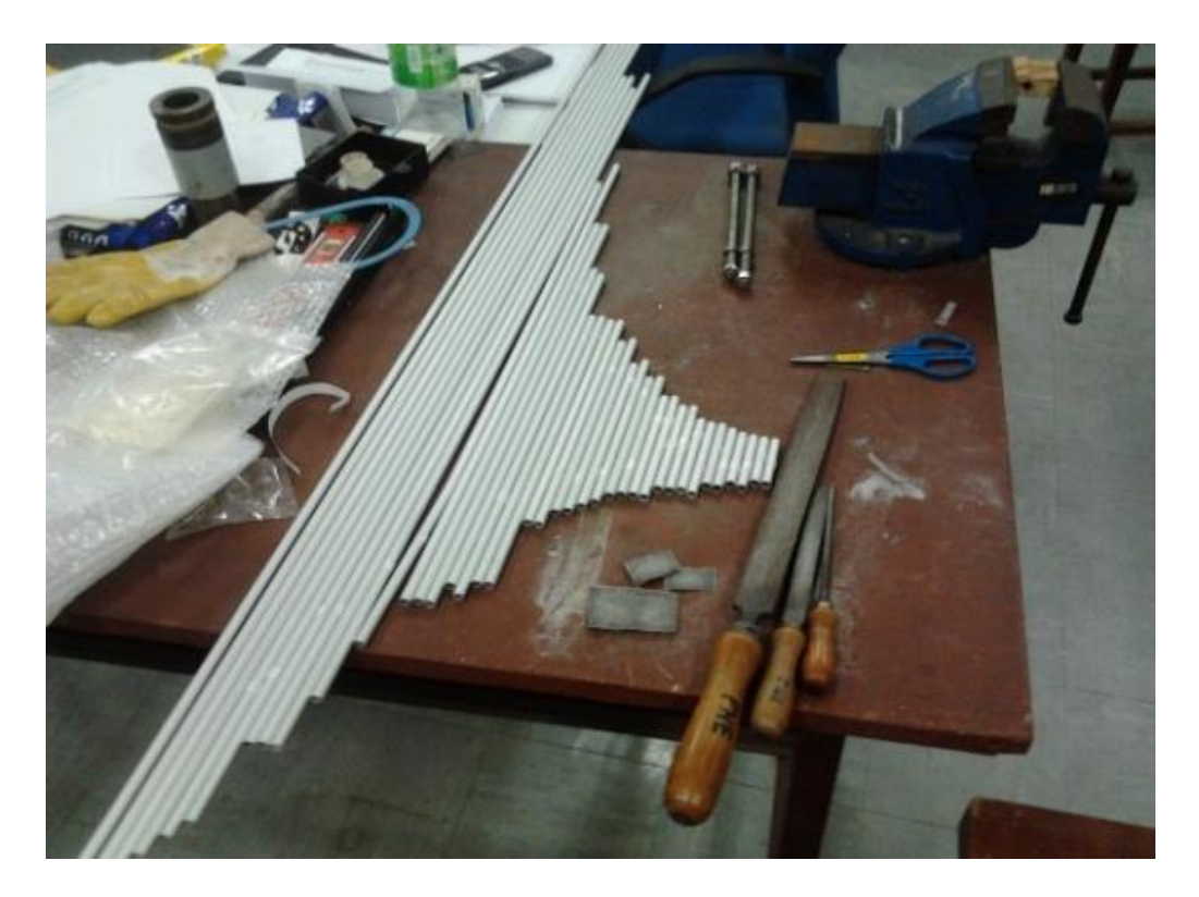
Figure 1. Preparation of construction of LPDA.