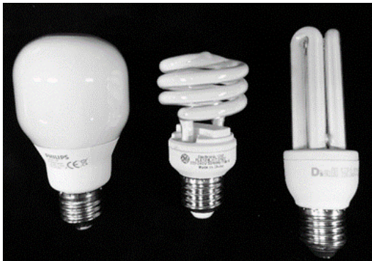
Fig. 2 View of the tested compact fluorescent lamps