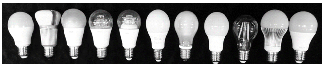
Fig. 3 View of the tested LED light sources