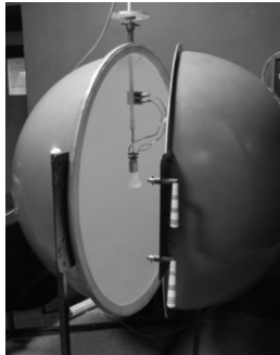
Fig. 6 View of the integrating sphere