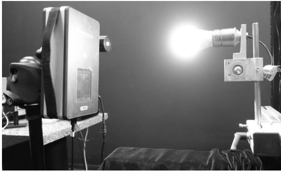
Fig. 5 View of the measuring set for the spectral distribution of a light source