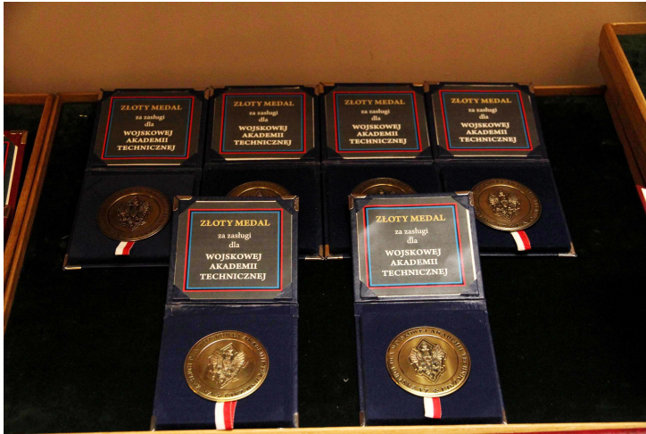
Fig. 6. Gold Medal of Merit for the Military University of Technology